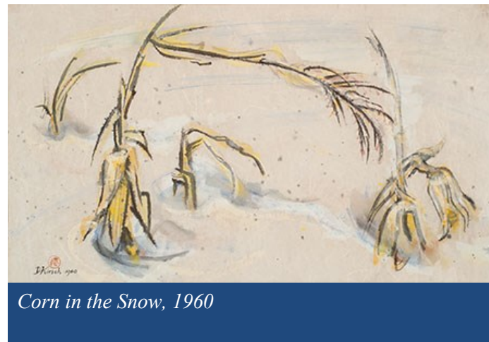
Corn in the Snow, 1960