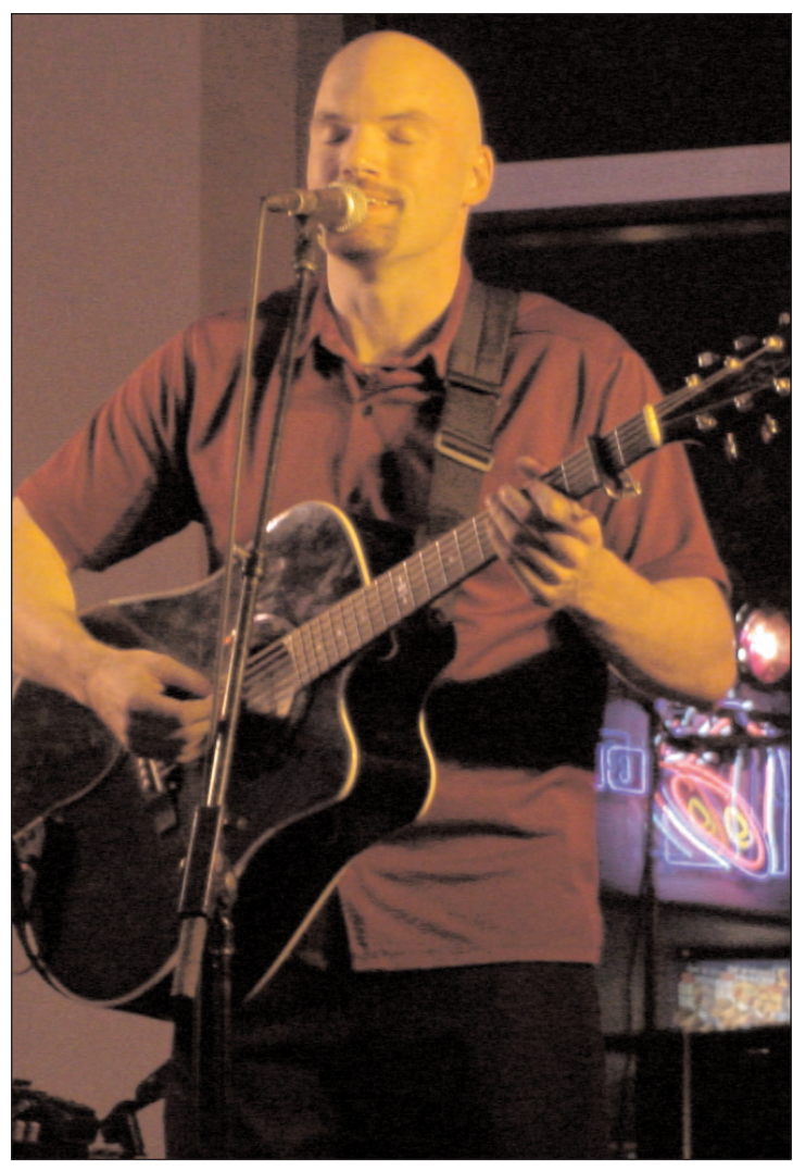
LPAC (formerly SAC) will be hosting such coffeehouse performances throughout the year.

Mochas and Music would not be complete without coffee. Loper Programming Activities Council, who sponsored the event, handed out Starbucks punch cards. After attending four coffee house performances, students can use the punch card for a $2.50 discount on coffee at Starbucks.