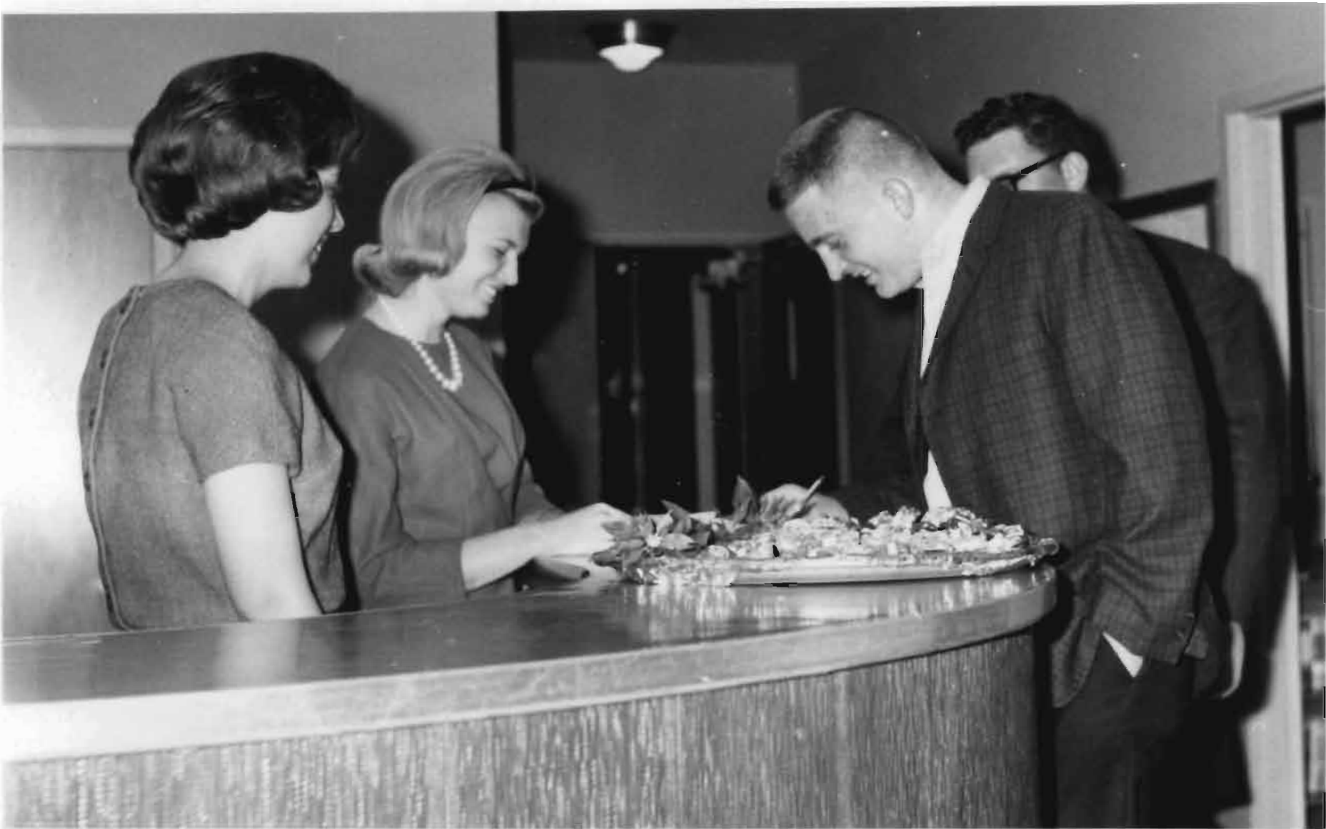
Martin Hall Students at Front Desk, 1965