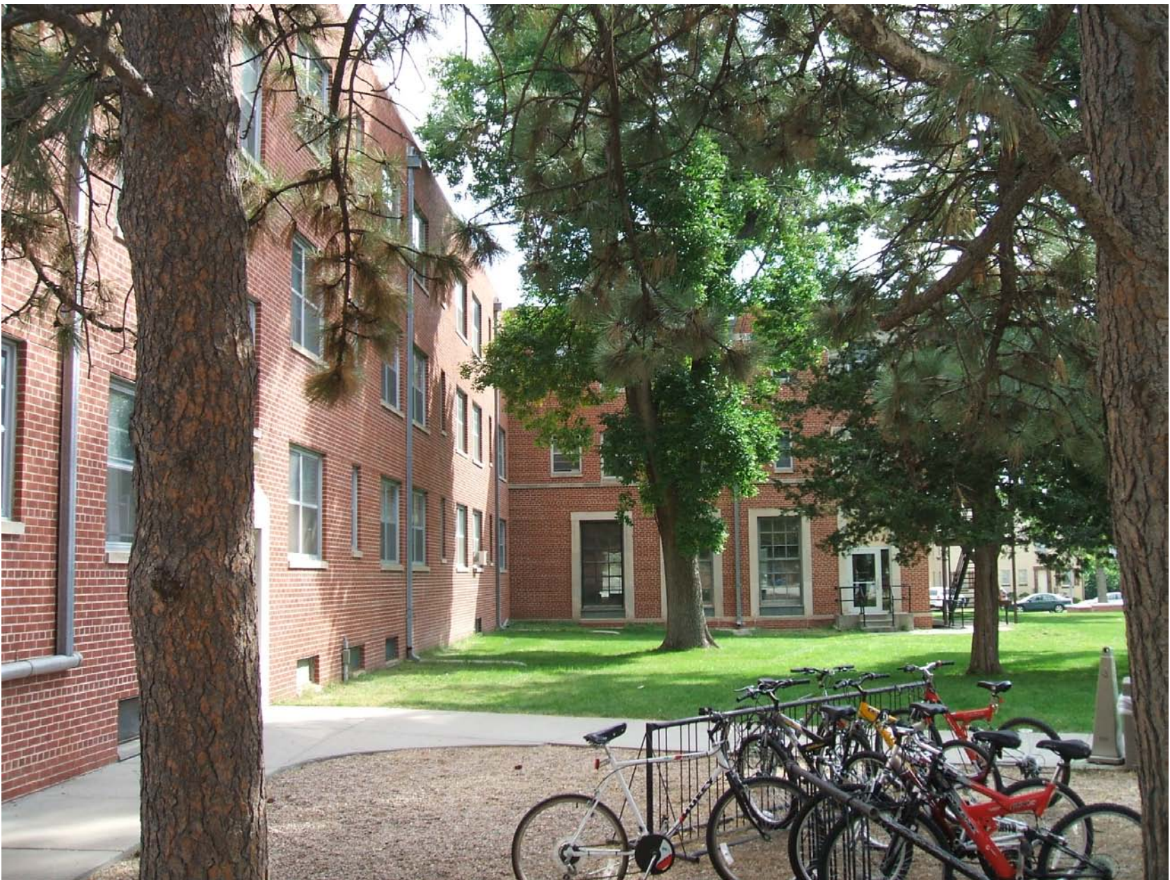
Martin Hall, 2009, View is to the East-Northeast