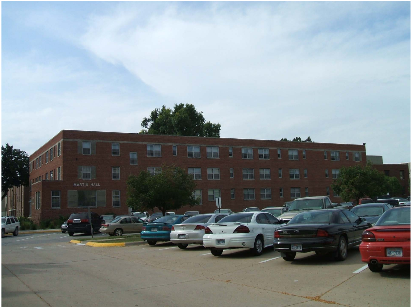
Martin Hall, 2009, View is to the South-Southwest