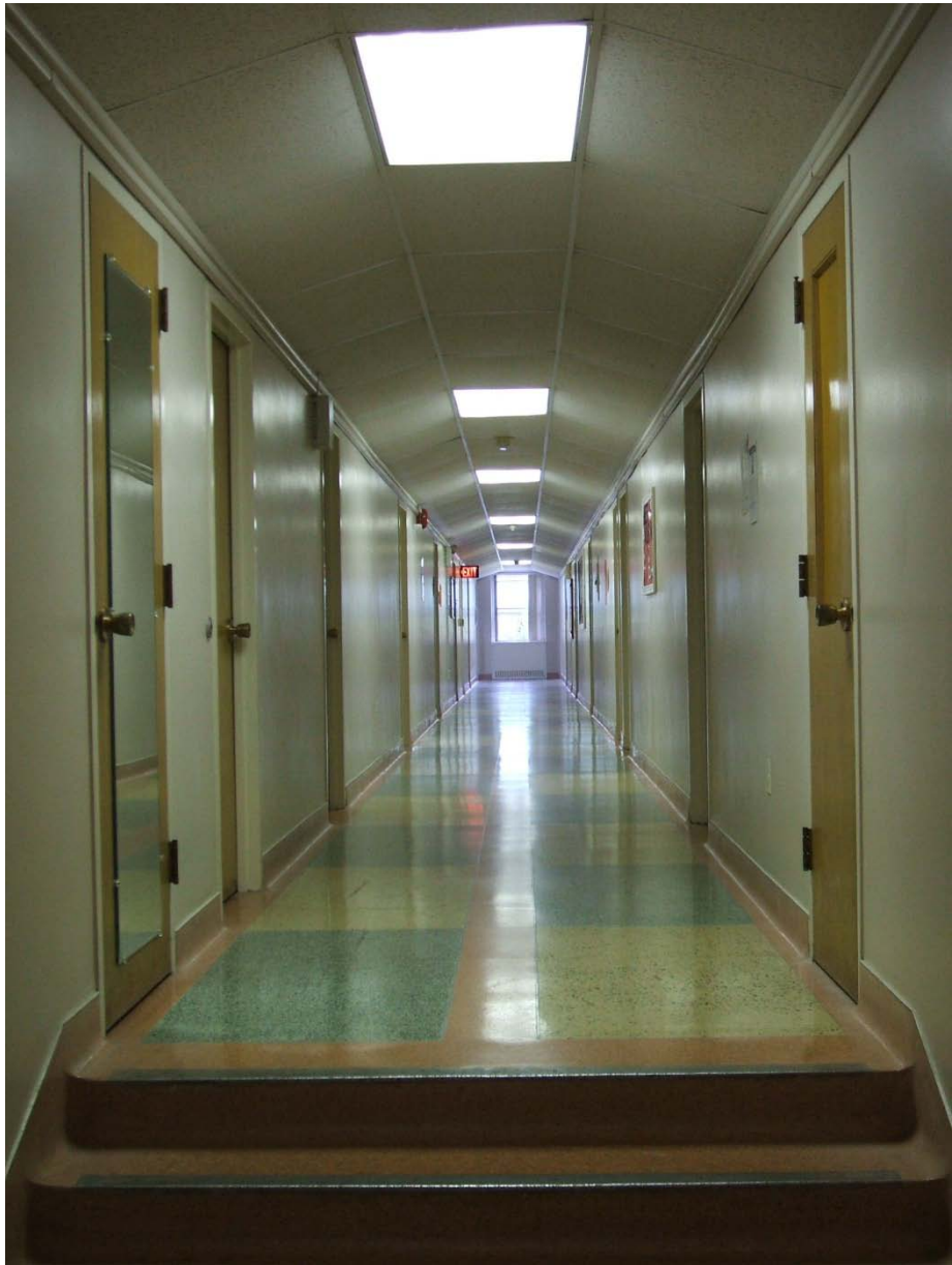
Martin Hall, 2009, First Floor Hallway View is to the West