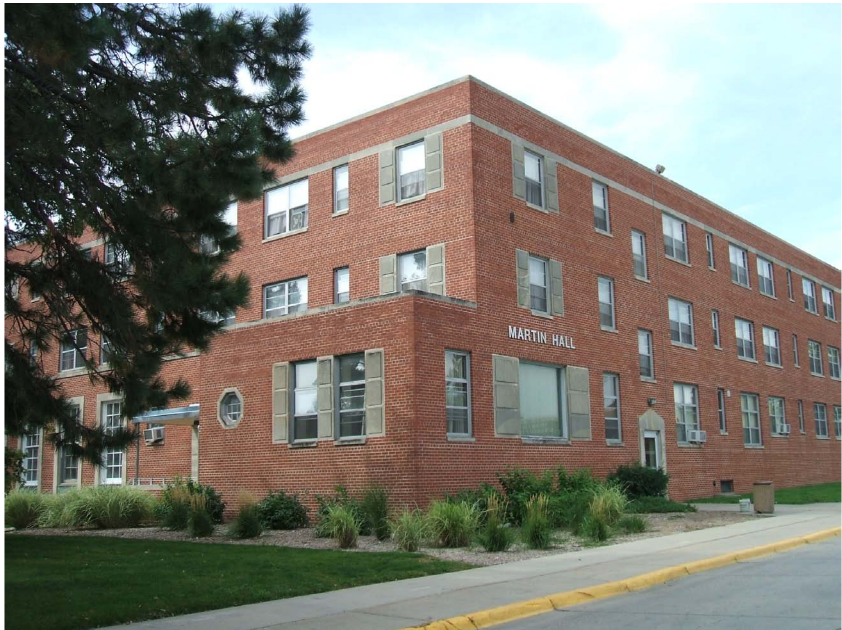
Martin Hall, 2009, View is to the Southwest