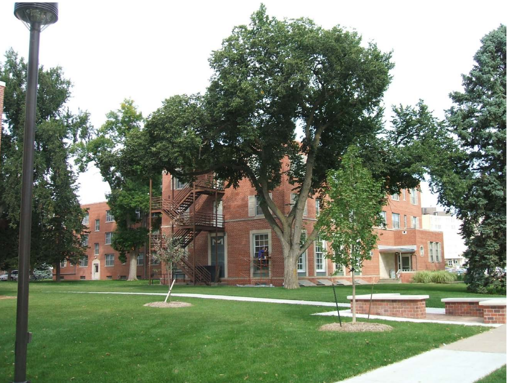
Martin Hall, 2009, View is to the Northwest