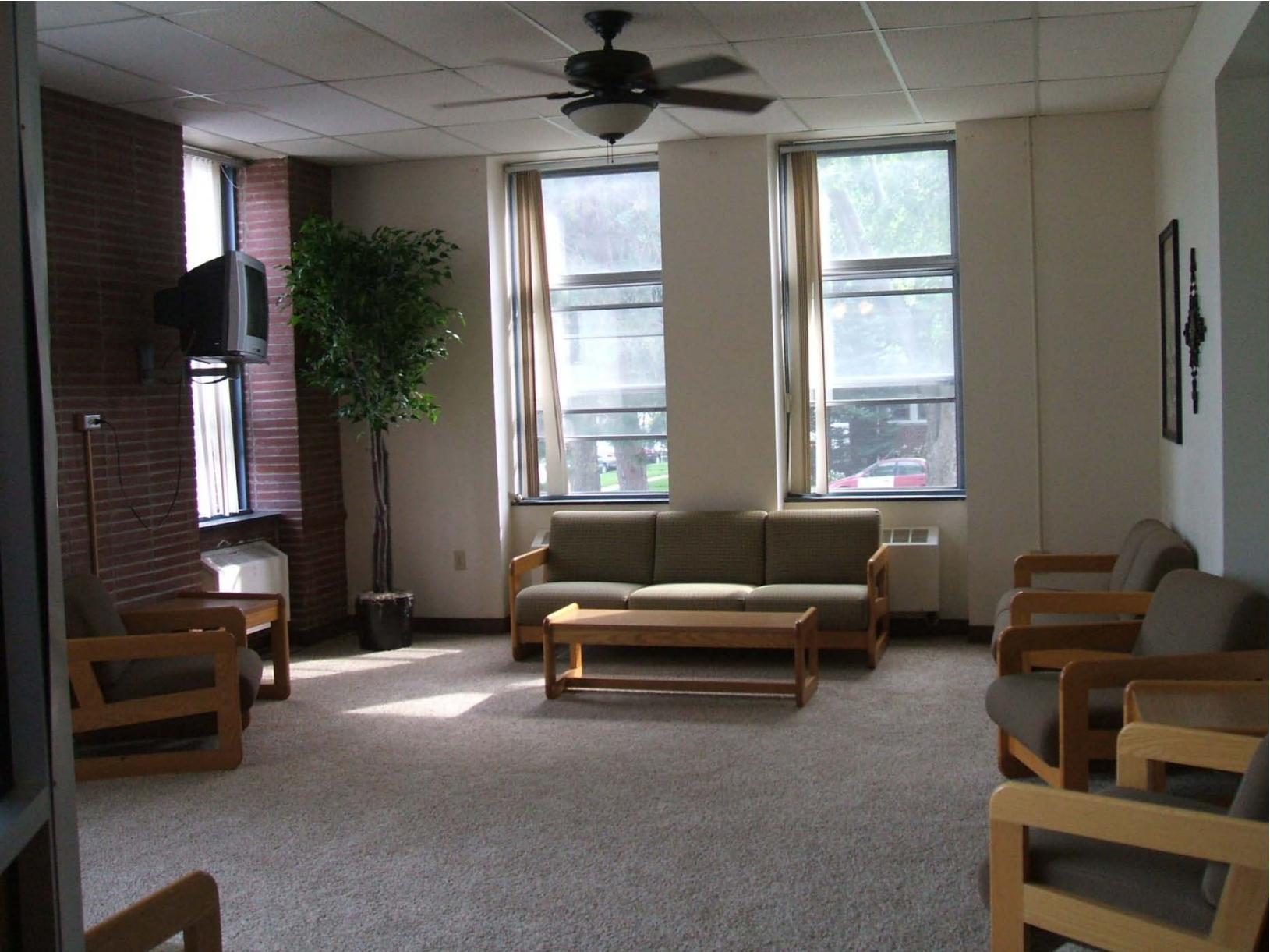
Martin Hall, 2009, TV Lounge