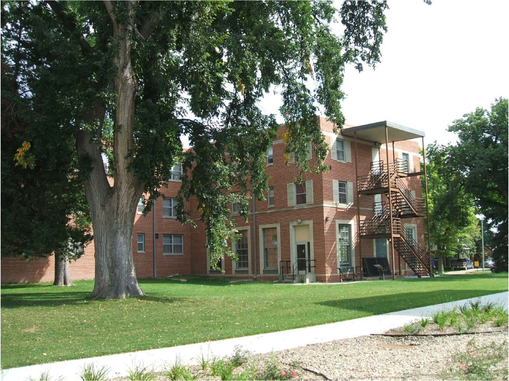
Martin Hall, 2009, View is to the Northeast