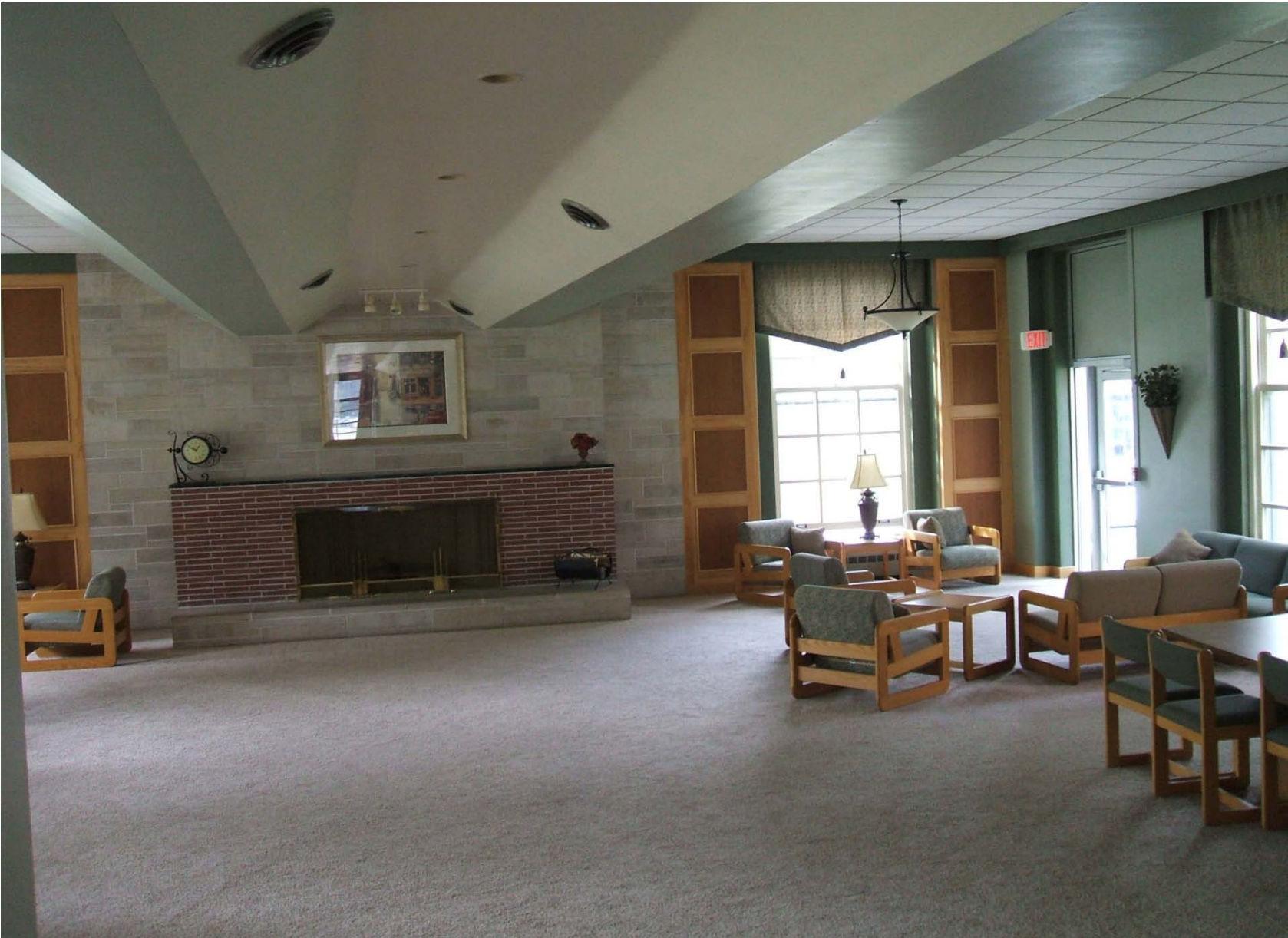
Martin Hall, 2009, Fireplace in Large Lounge