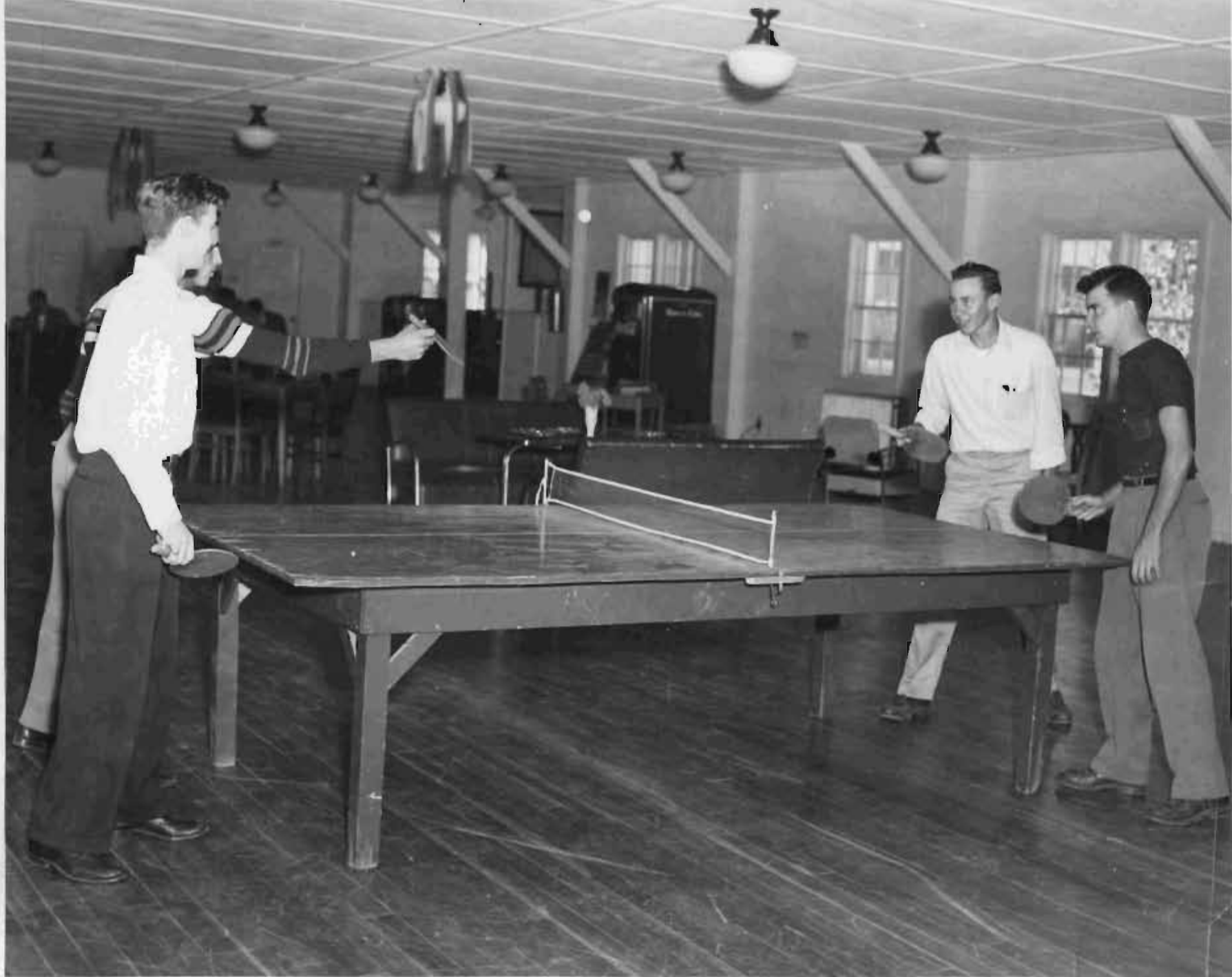
Game Room in Temporary Student Union, 1950