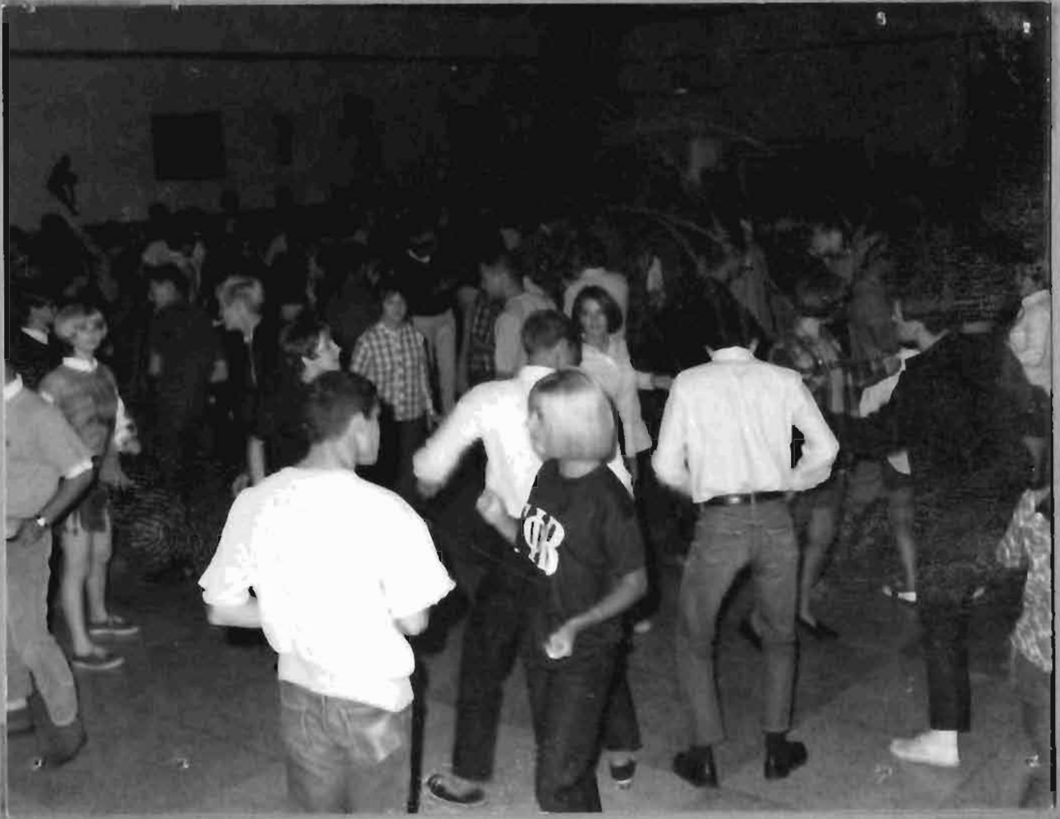
Temporary Student Union, Dance, 1950's