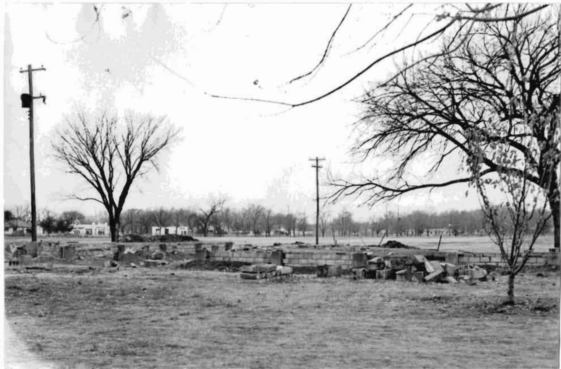
Dismantling of Temporary Student Union, 1958 View Looks to the Southwest