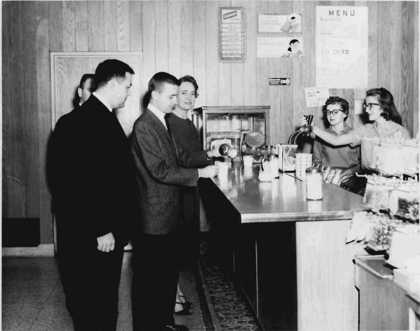
Snack Bar at Temporary Student Union, 1956