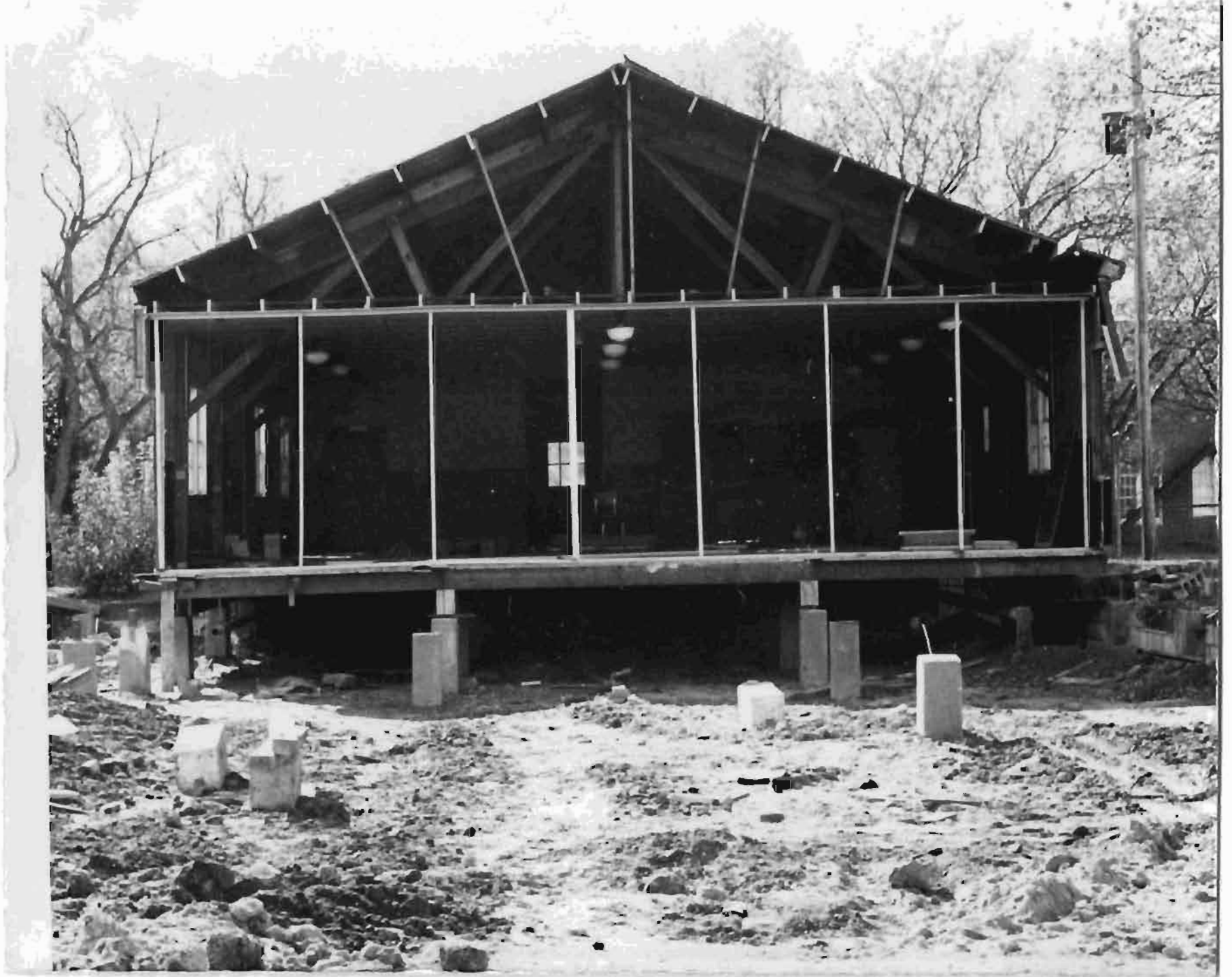
Removal of Temporary Student Union, 1958