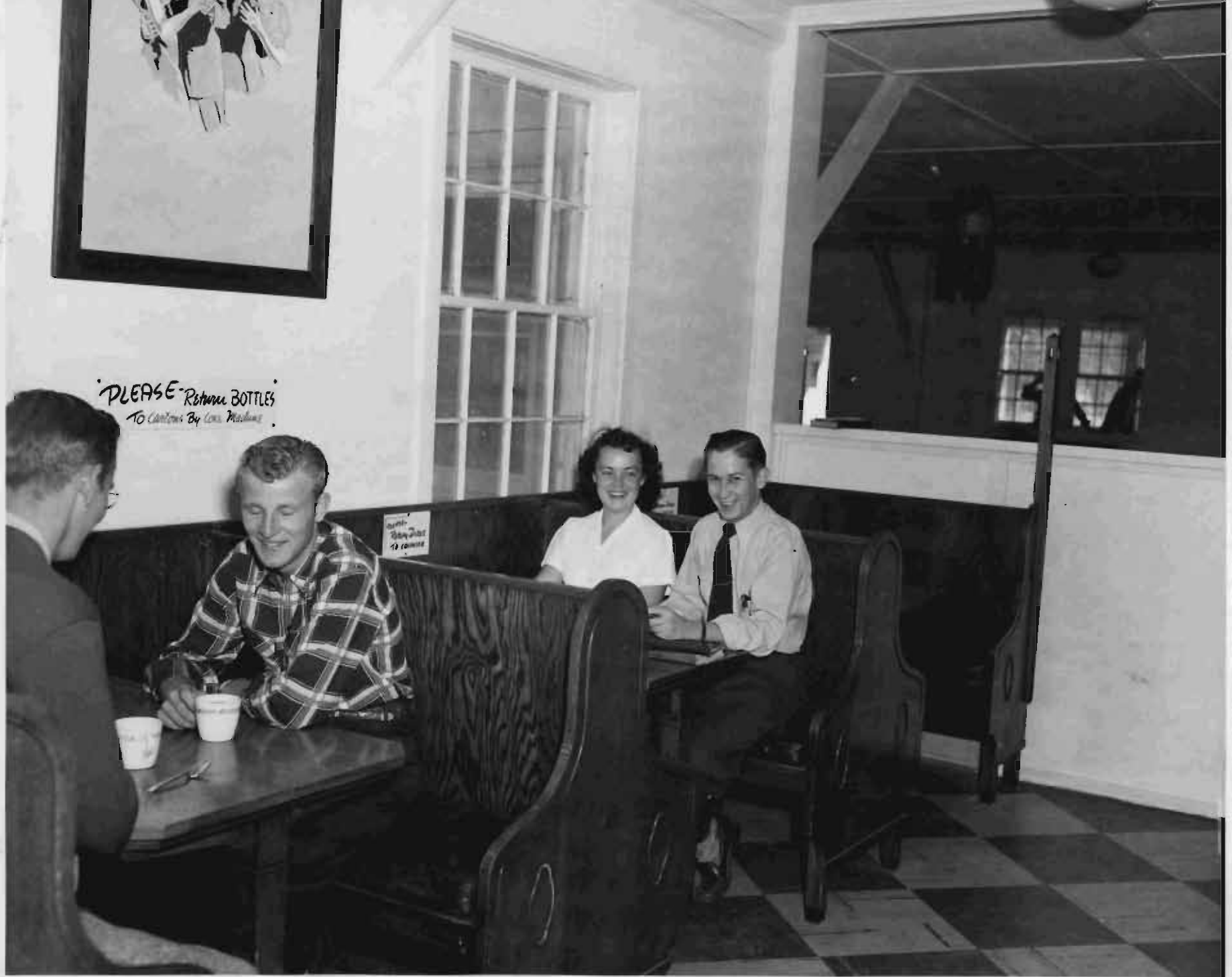
Snack Bar in Temporary Student Union, 1949