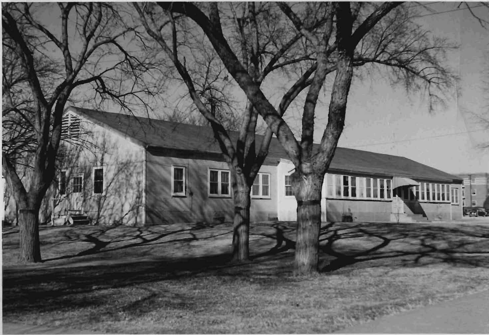
Temporary Student Union, 1949. View Looks to the Northwest. Men's Hall Visible at Far Right