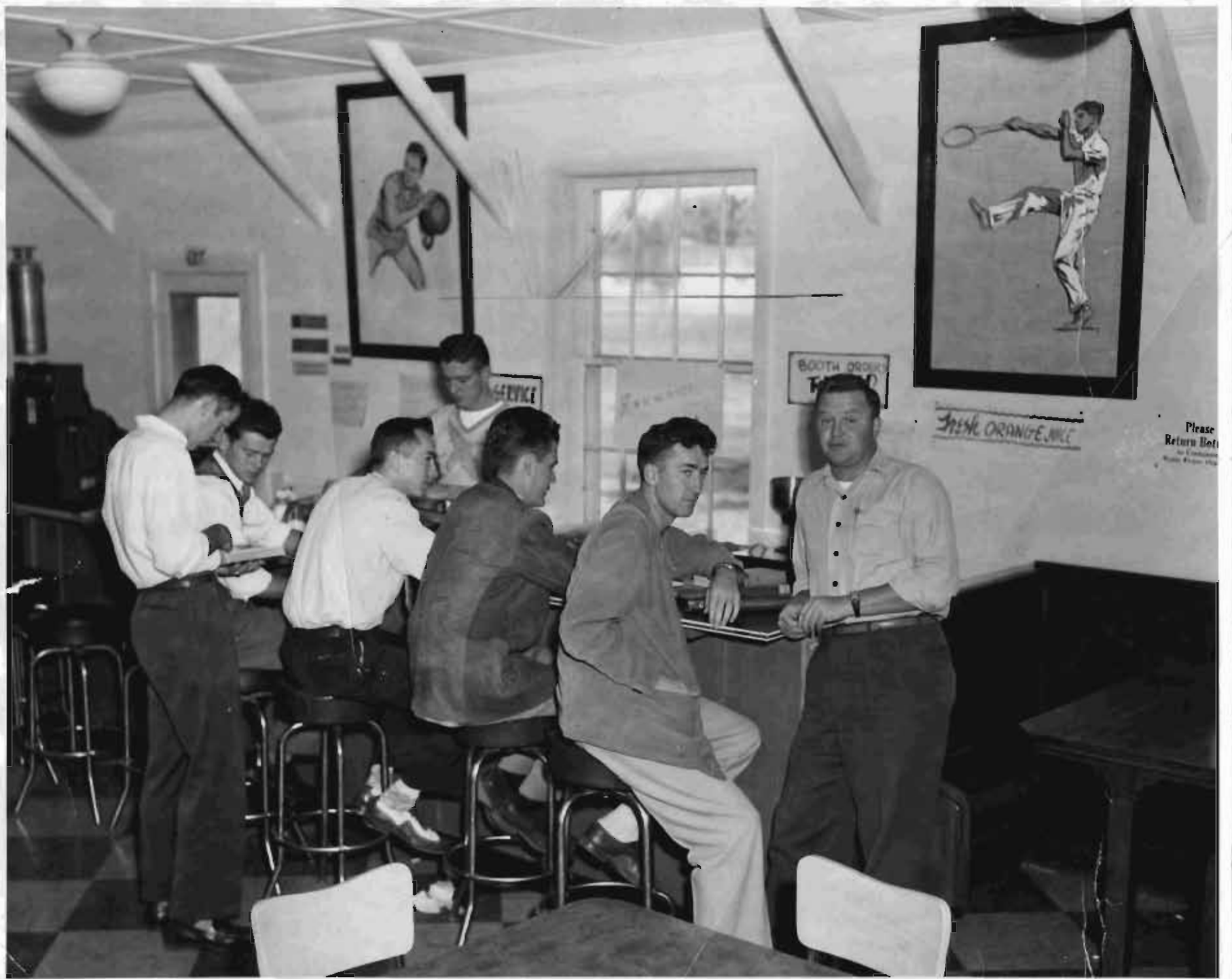
Snack Bar in Temporary Student Union, 1949