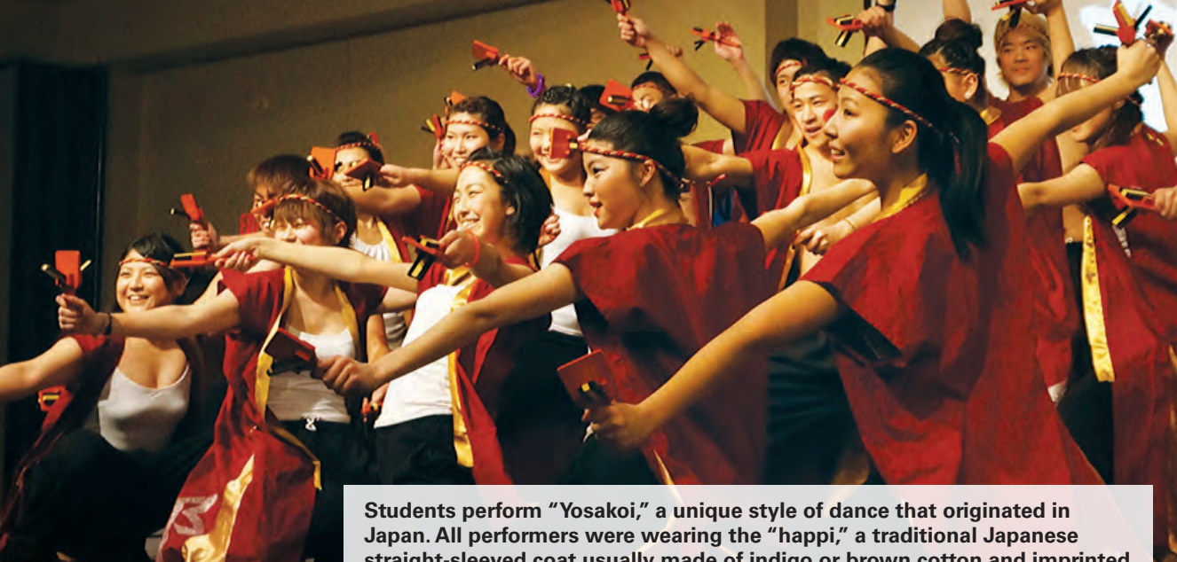
straight-sleeved coat usually made of indigo or brown cotton and imprinted with a distinctive mon, or crest.