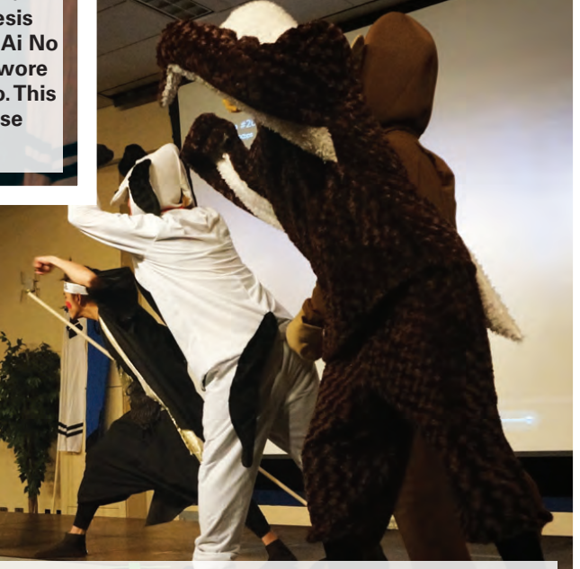
ons, perform the tale, the "Momotaro." The skit is ge peach (momotaro means peach in Japanese). Mos with his friends the dog, monkey and eagle.