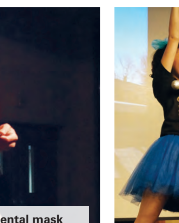
ental mask i dance "Kenf empty. I enbai is very new and