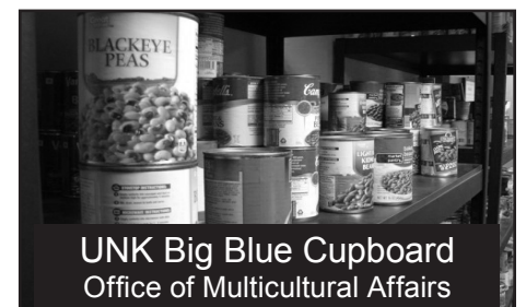
UNK Big Blue Cupboard Office of Multicultural Affairs