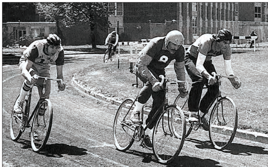
The first Bike Bowl was hosted at Kearney State College in 1967.