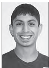
BY TYLER CAVALLI Antelope Staff

Students, selected top 5 in the nation, compete in Intercollegiate Broadcasting System Awards