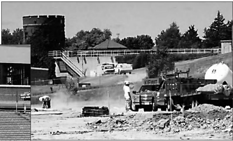
Reconstruction of the parking lot next to Randall Hall and Mantor Hall.