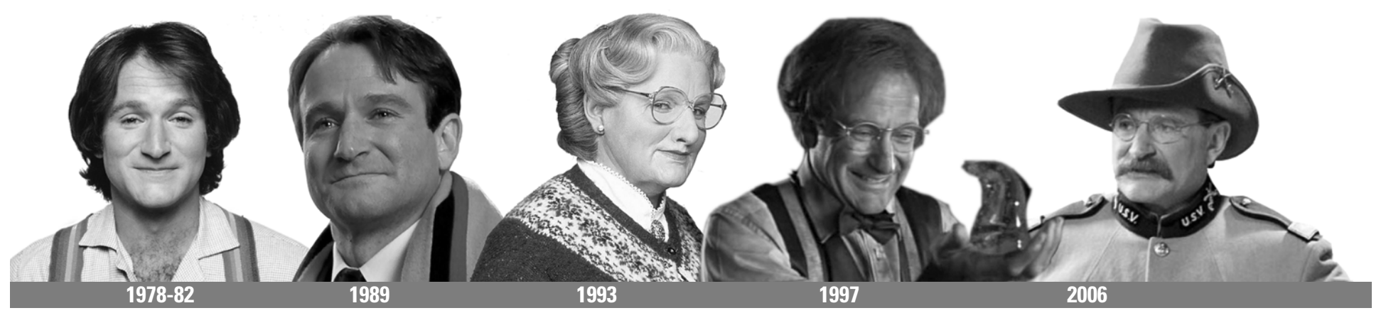
Mork in Mork & Mindy