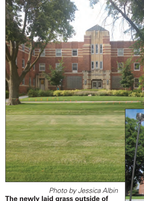
The newly laid grass outside of Mens Hall is a refreshing scene. The area previously housed construction equipment.

Experience a preview of the 2014 soccer team as they display their talent for the first time this season.