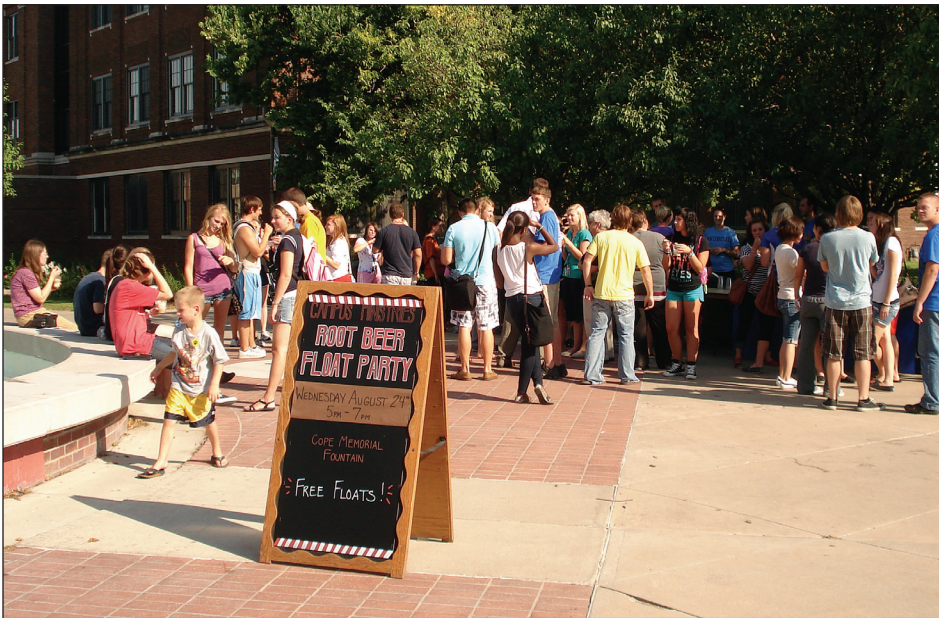
Wednesday, August 24, campus ministries came together to provide students with free root beer floats near the fountain. Students were provided with information on different campus ministries available.