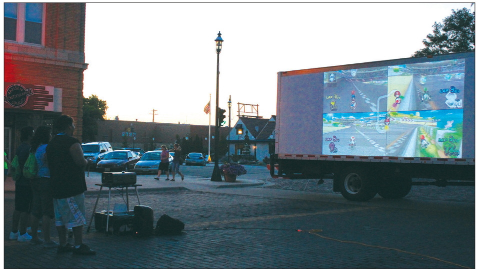
There was a variety of activities for students at Destination Downtown on Thursday. There was Mario Kart on the Wii projected on the side of a truck for people to play.