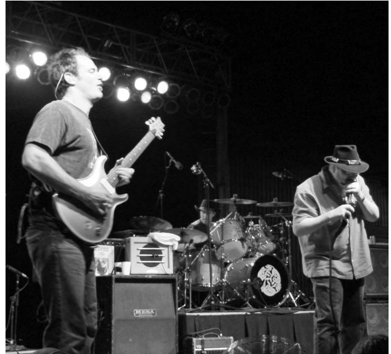
Blues Traveler sweats under the lights at Coopfest. Even through the heat and the pressure of the performance, Popper and crew kept their cool to provide a night of music that the crowd will never forget.

the mainstream. In 1994 Blues Traveler released their fourth album, simply titled "Four," and lightning struck. The first single, "Run Around," was a chart-top-