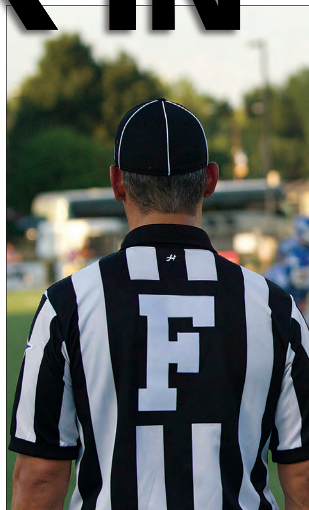
ABOVE: The UNK Lopers football team played Wash- burn during their season opener last Thursday.