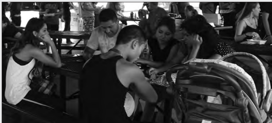
The Office of Multicultural Affairs invited students, faculty and staff to their annual barbecue on Thursday in Harmon Park Aug. 29.