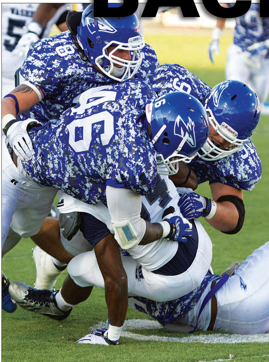
The Loper defense stops the Washburn offense during the UNK season opener.