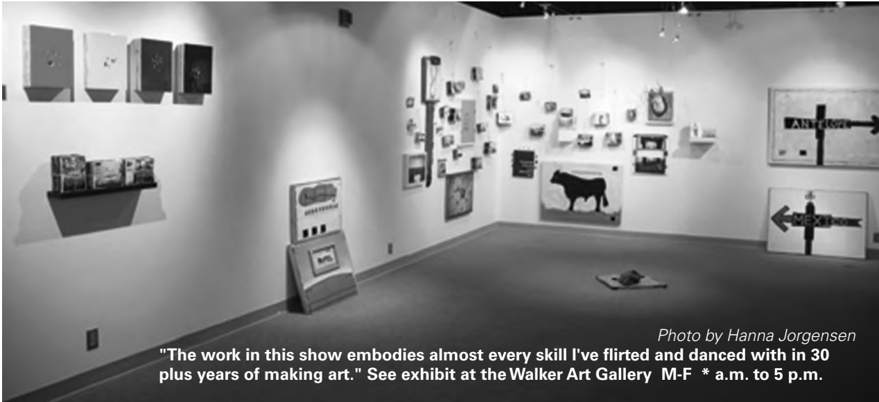
"The work in this show embodies almost every skill I've flirted and danced with in 30 plus years of making art." See exhibit at the Walker Art Gallery M-F * a.m. to 5 p.m.