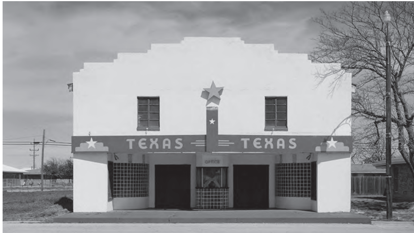
Texas Theater, Bronte, Texas, 2003

Haruf has a B.A. degree in English from Nebraska Wesleyan University and a M.F.A. from the Writers' Workshop at the University of Iowa. He has also served in the U.S. Peace Corps. Haruf taught high school English in Wisconsin and Colorado as well as fiction writing at Nebraska Wesleyan University and Southern Illinois University. He is the author of five novels. Of those five novels, "Plainsong," "Eventide" and "Benediction" all became national bestsellers.