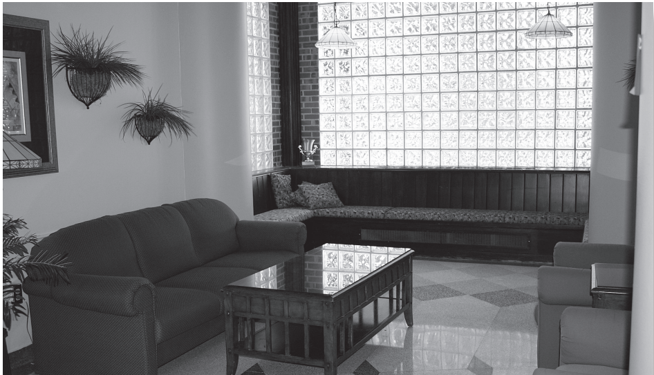
Renovations in Men's Hall were completed in fall 2010. Men's Hall is the oldest residence hall on campus and was brought up to date with a new entrance area.