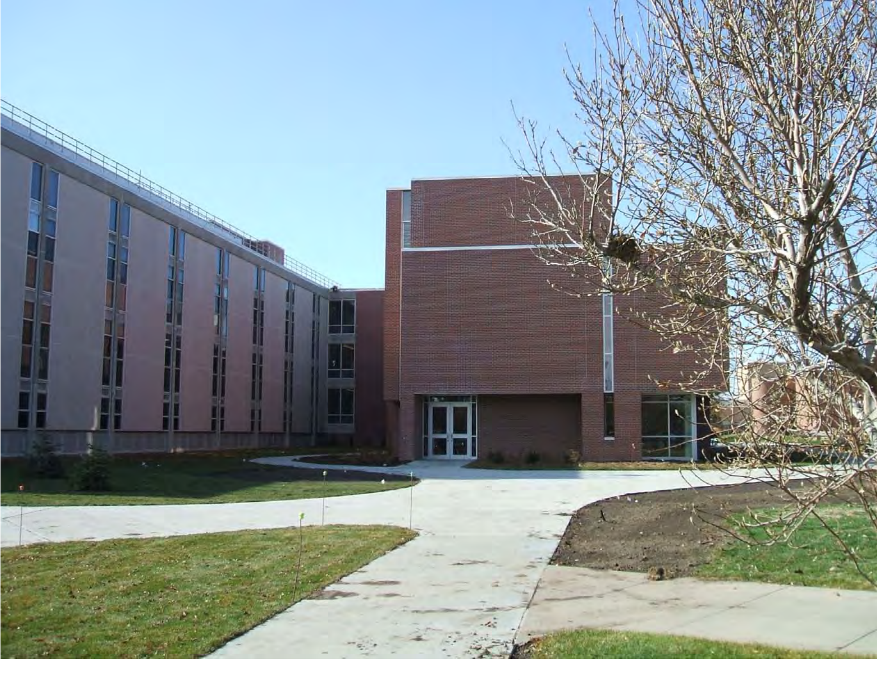
William E. Bruner Hall of Science, 2009 View Looks to the West