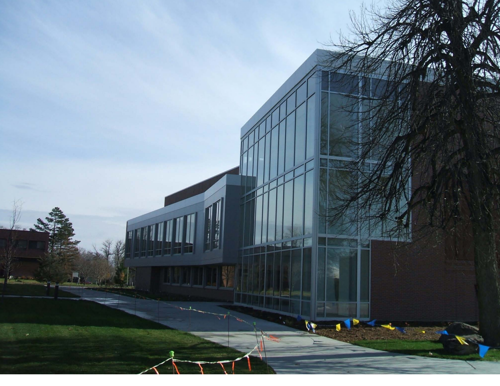
William E. Bruner Hall of Science, 2009 View Looks to the East-Southeast