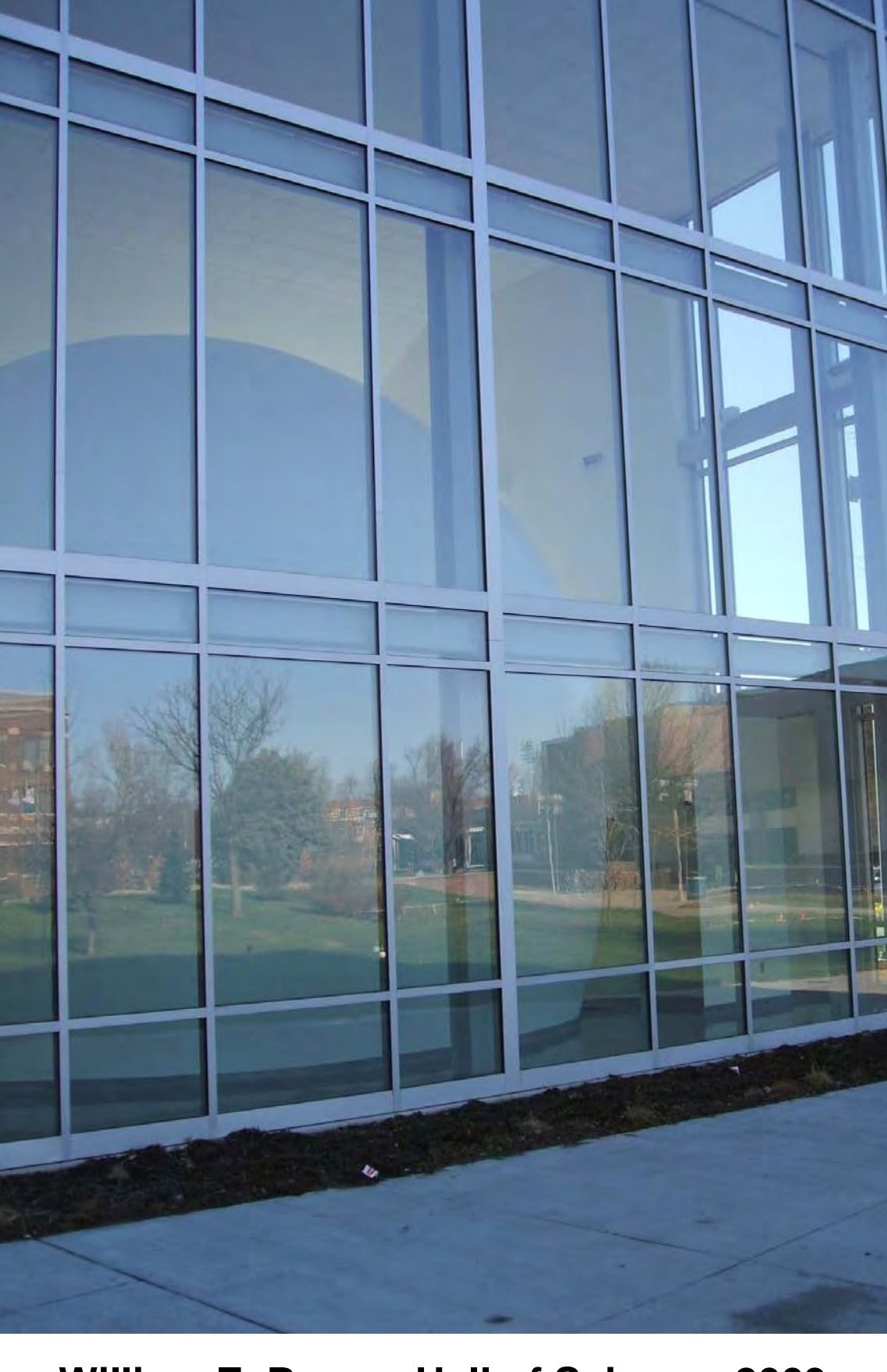
William E. Bruner Hall of Science, 2009 View Looks to the Southwest