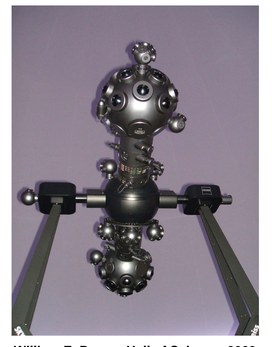
William E. Bruner Hall of Science, 2009 Zeiss Starmaster ZKP 4 Projector in Planetarium