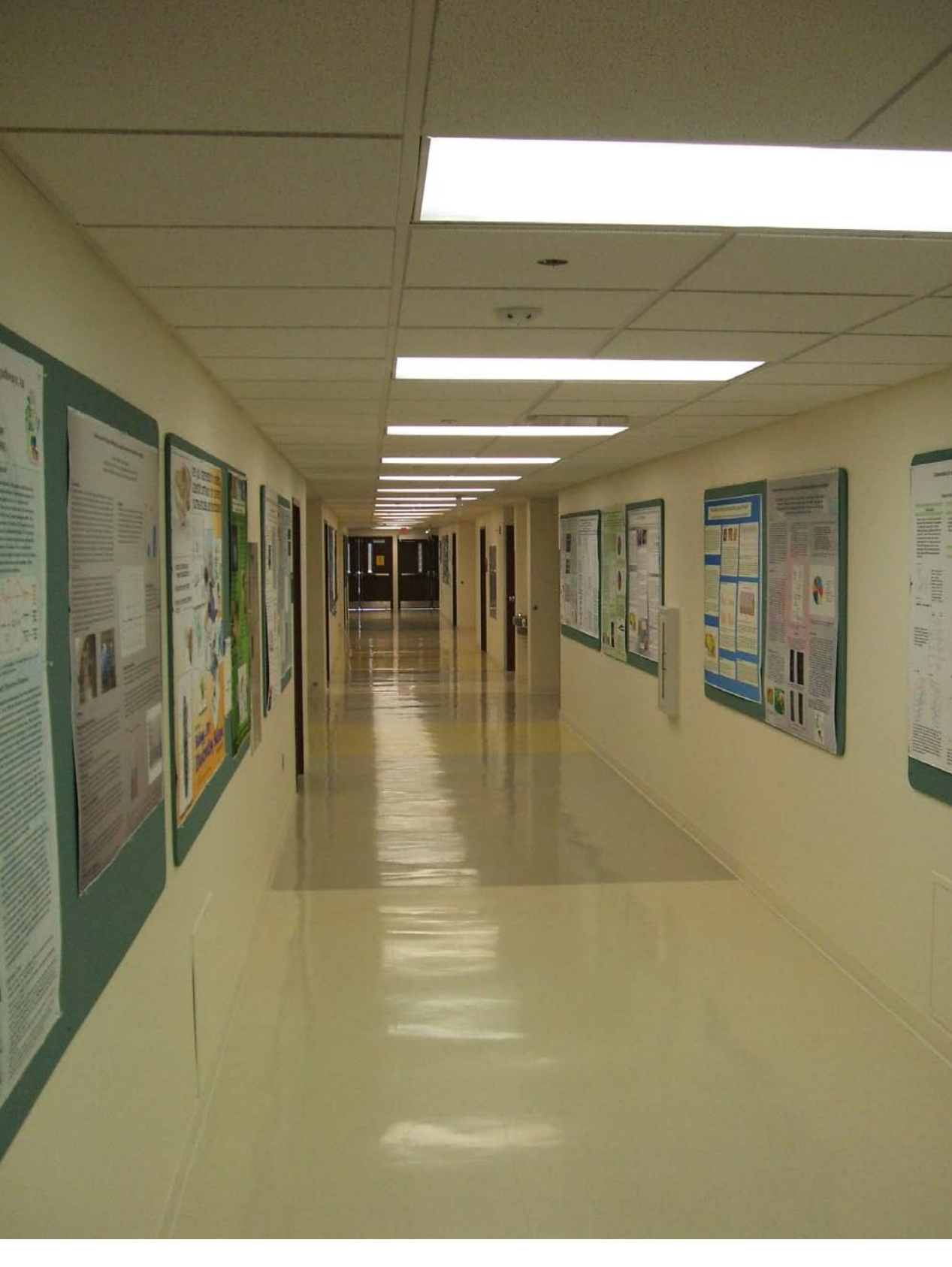
William E. Bruner Hall of Science, 2009 Hallway, Second Floor