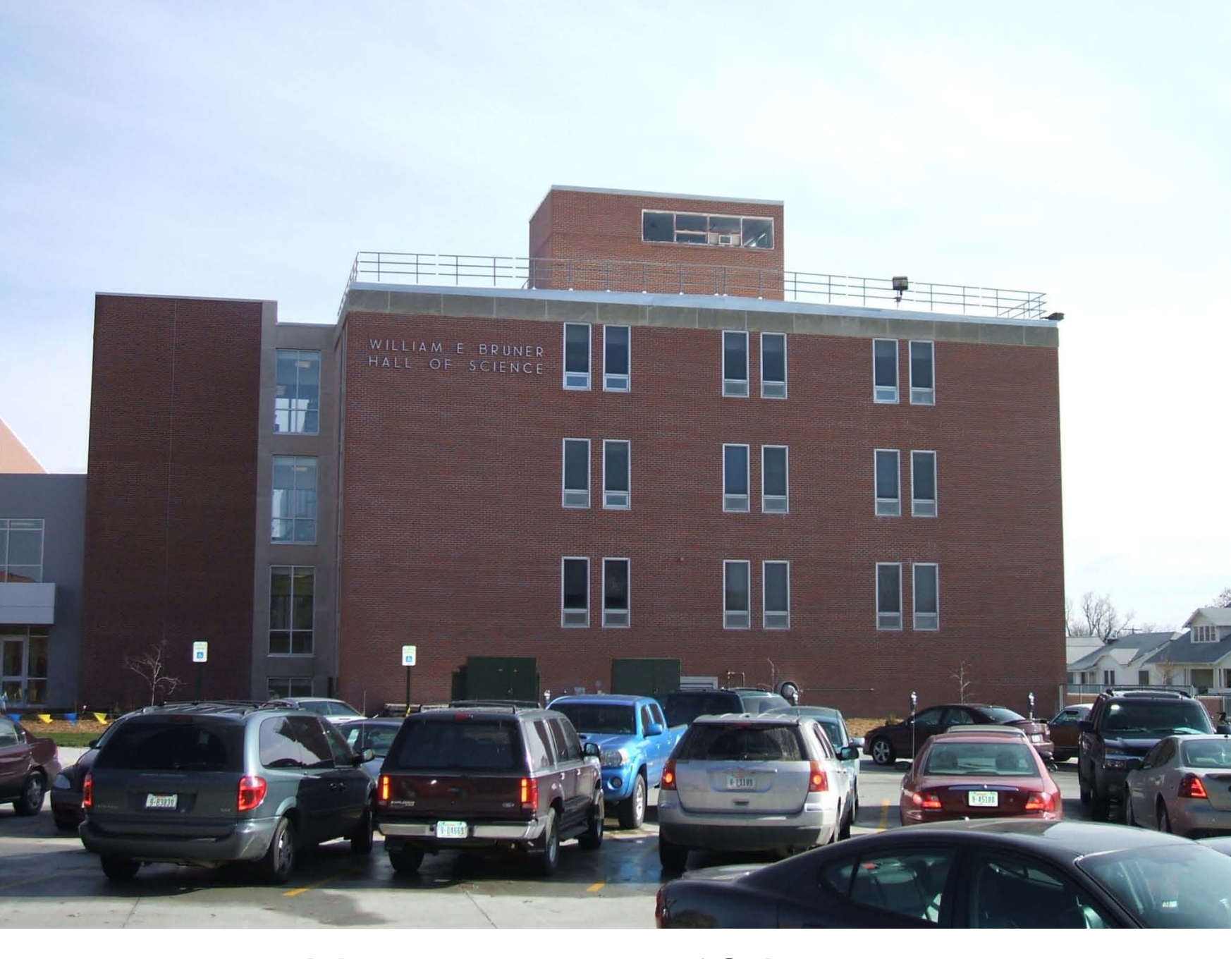
William E. Bruner Hall of Science, 2009 View Looks to the East