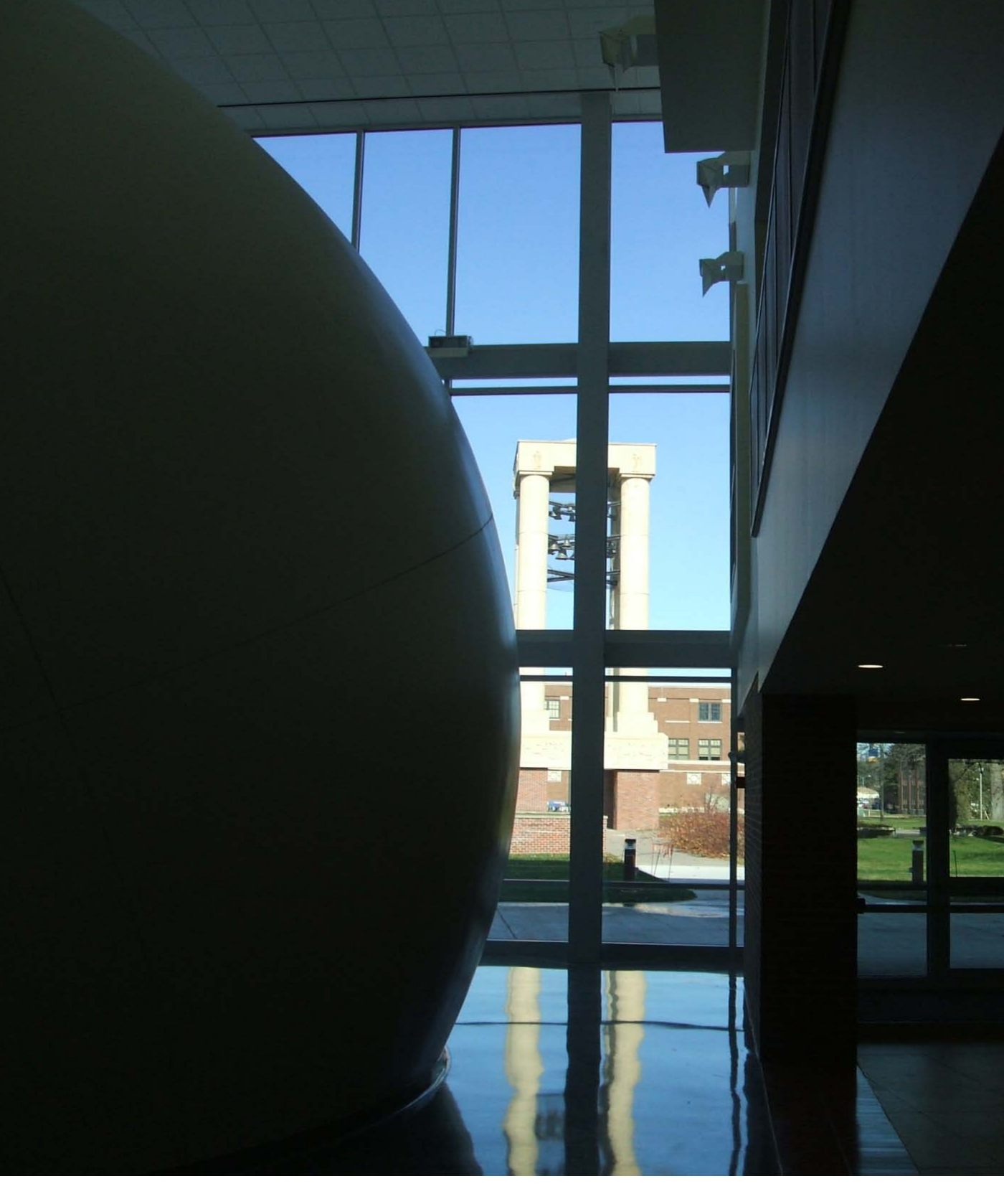
William E. Bruner Hall of Science, 2009 Looking Past Planetarium to Memorial Carillon Tower