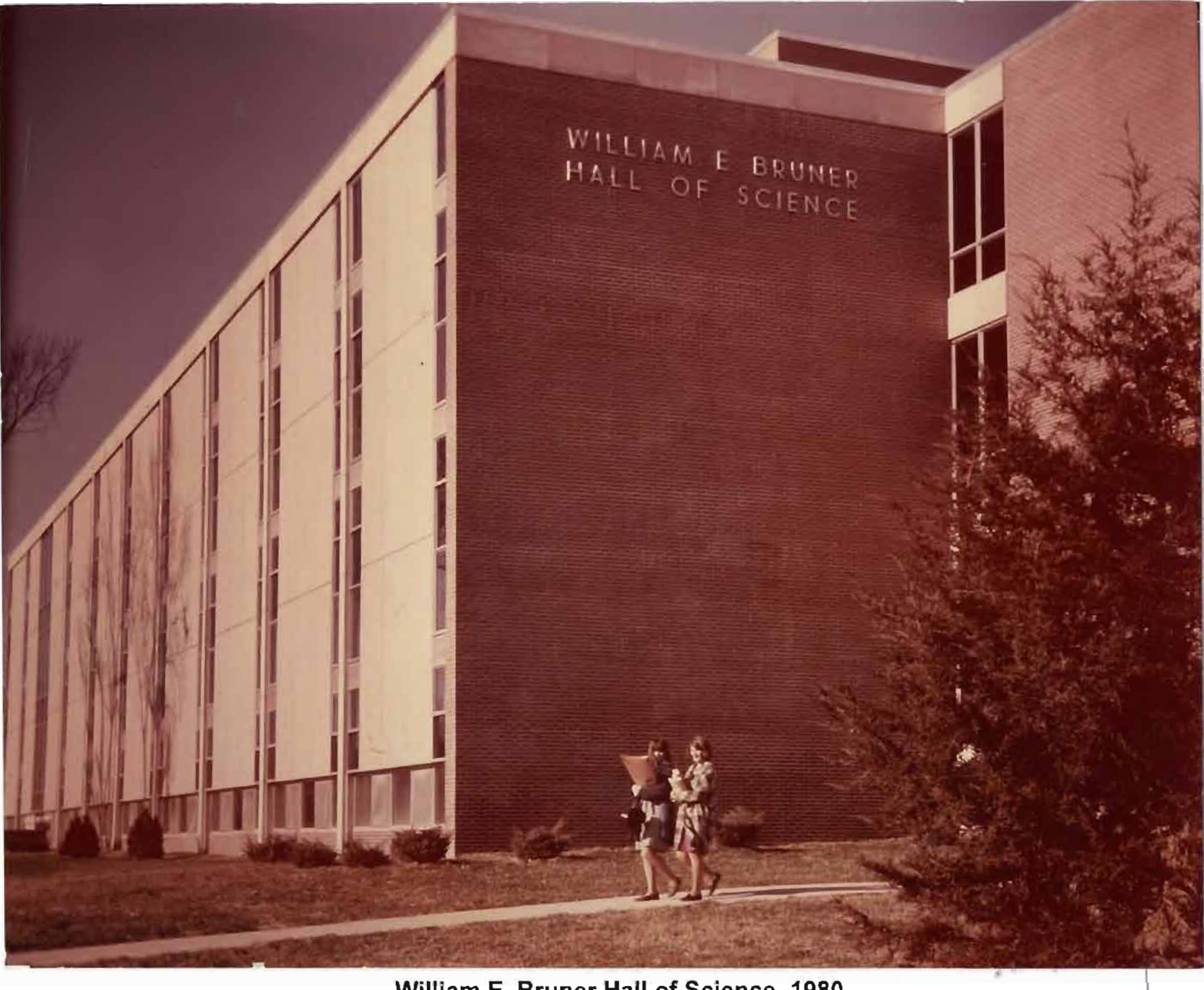
William E. Bruner Hall of Science, 1980 View Looks to the Northwest