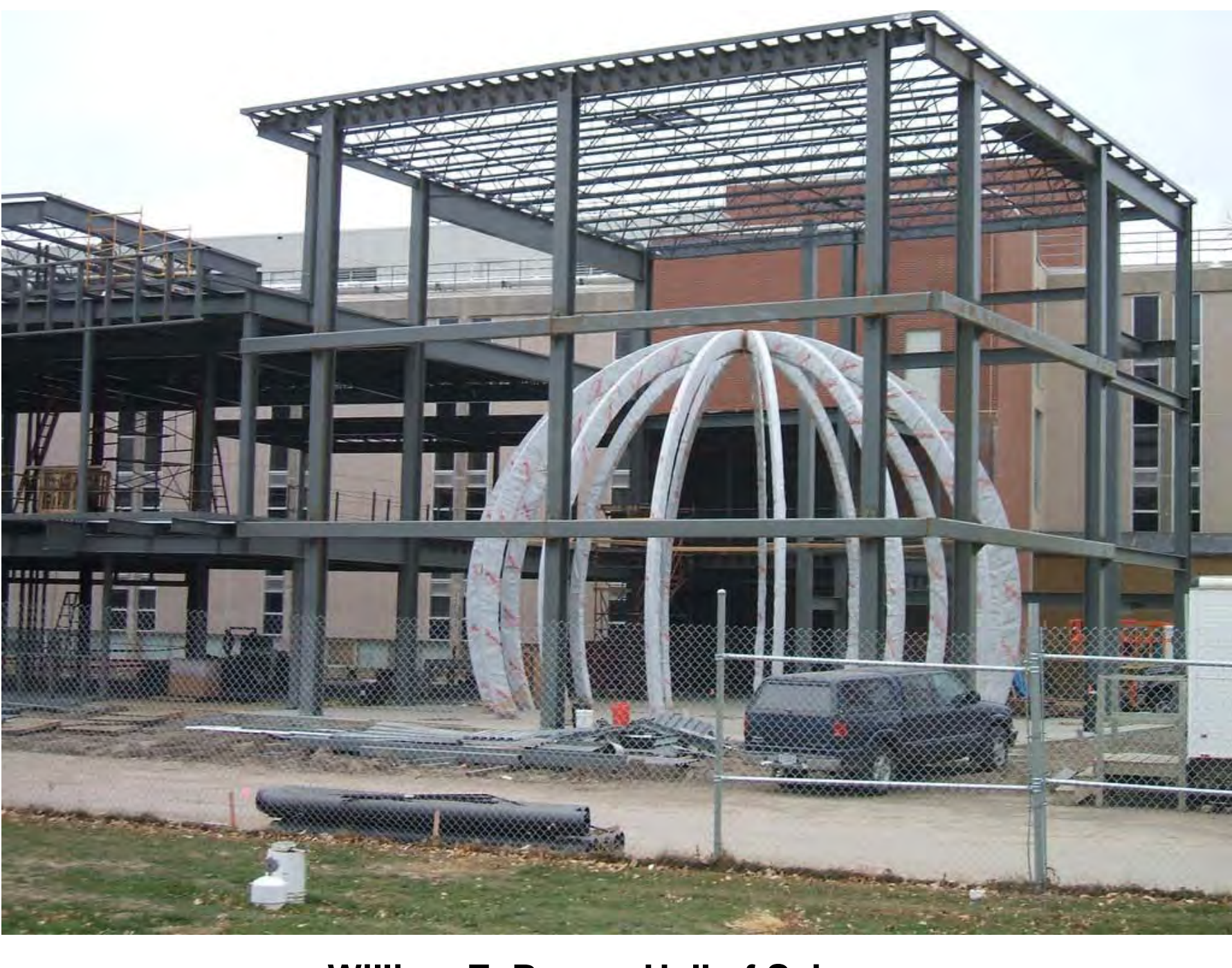
William E. Bruner Hall of Science Planetarium Under Construction, Fall 2008