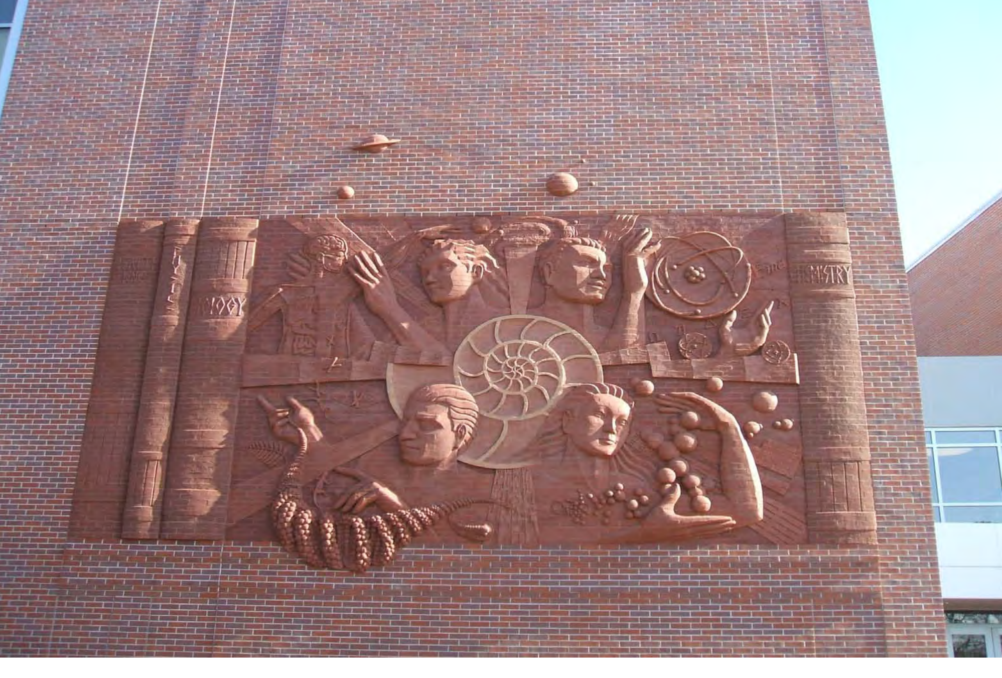
William E. Bruner Hall of Science, 2009 Mural "On the Shoulders of Giants" on West Wall