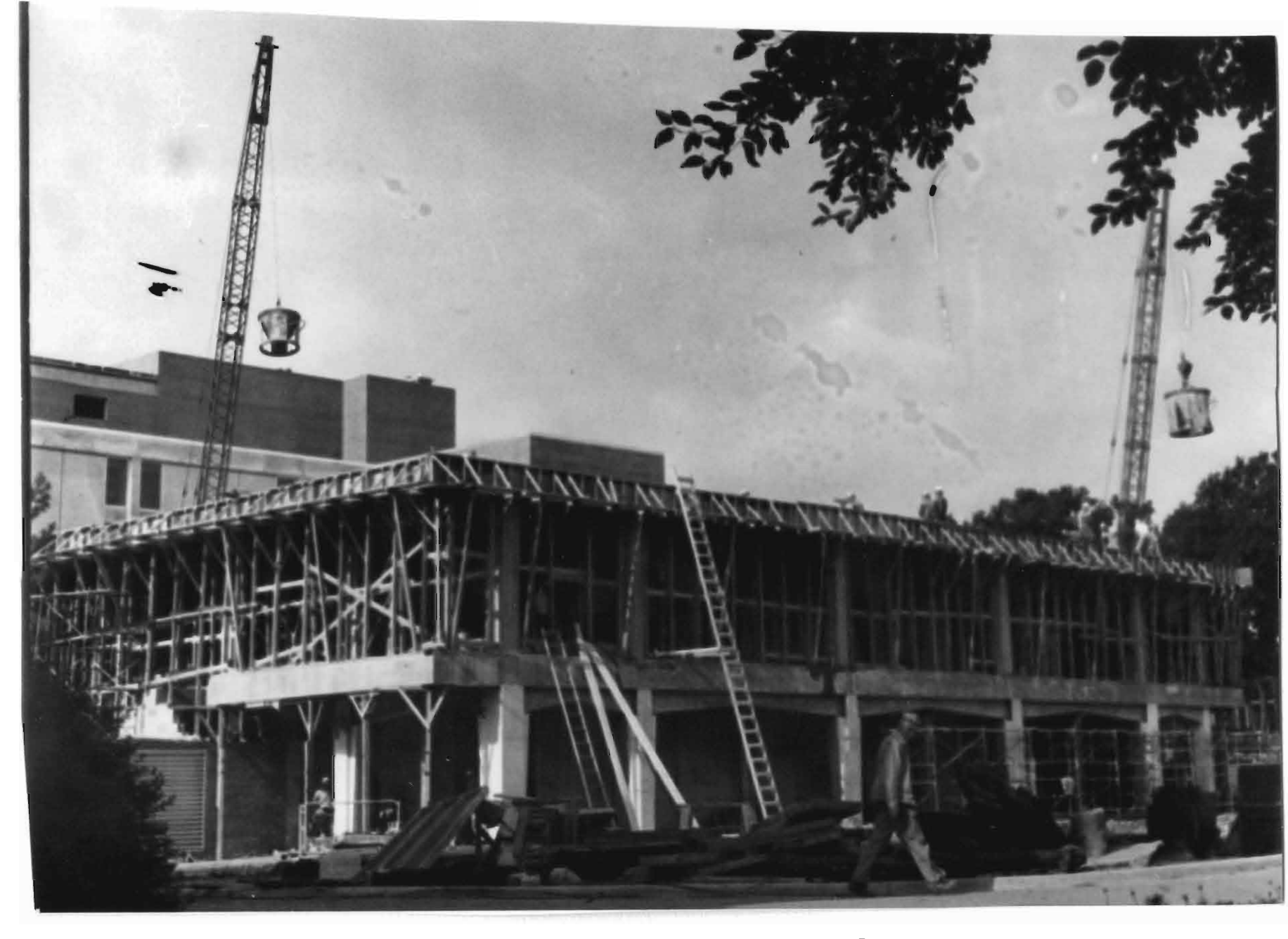
Mary E. Morse Lecture Hall Under Construction, 1965 Exterior, View Looks to the Southwest