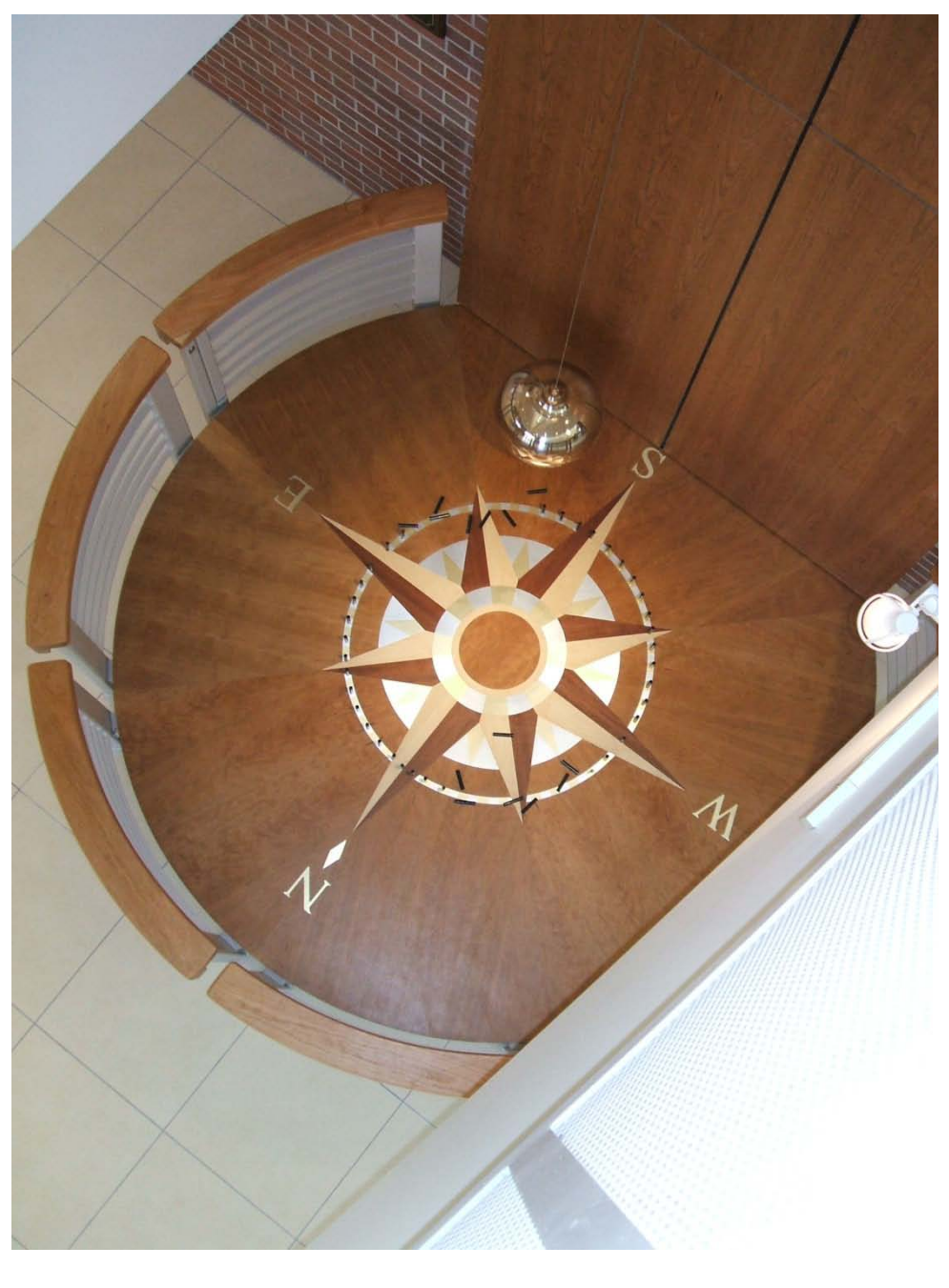
William E. Bruner Hall of Science Pendulum, 2009