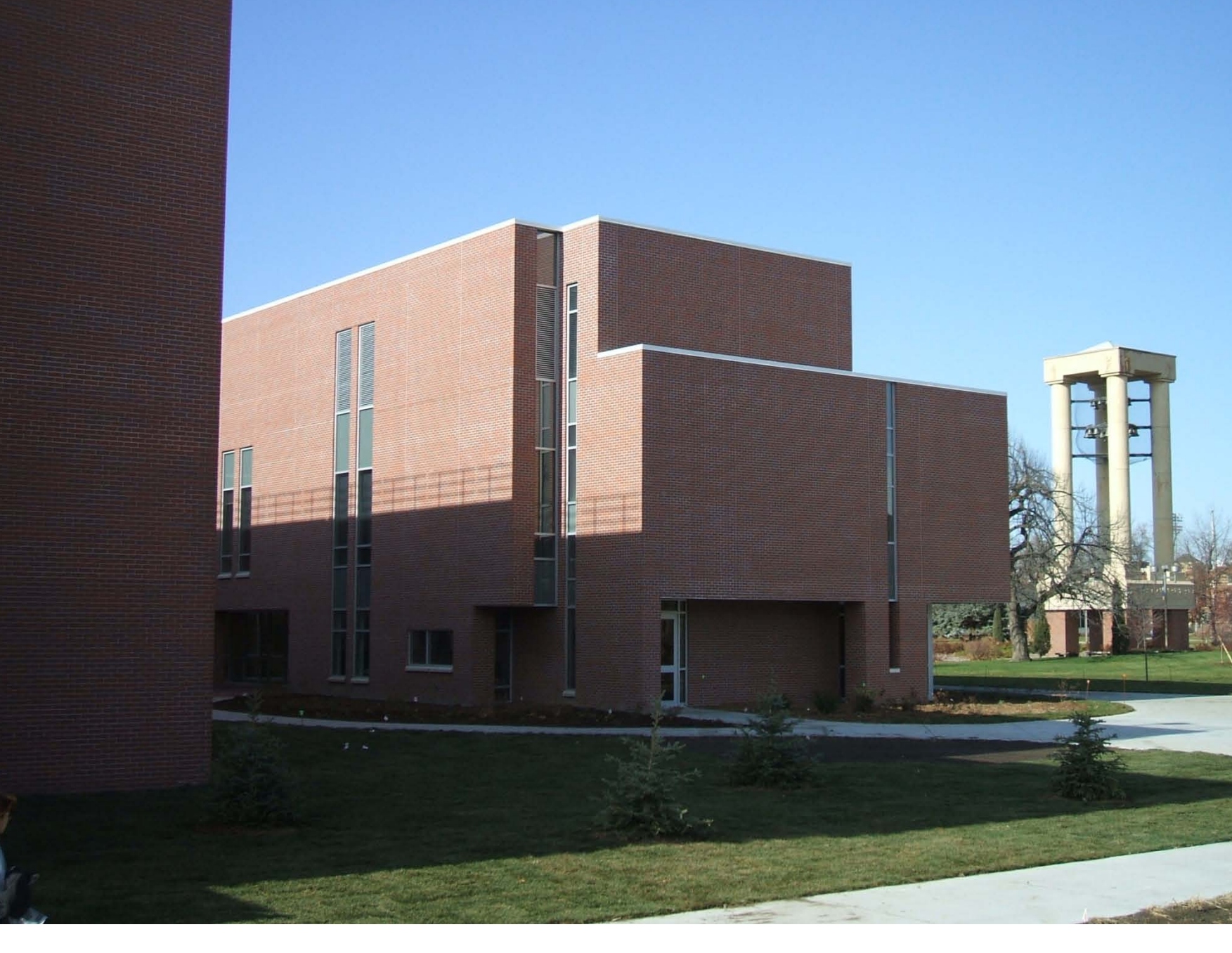
William E. Bruner Hall of Science, 2009 View Looks to the Northwest