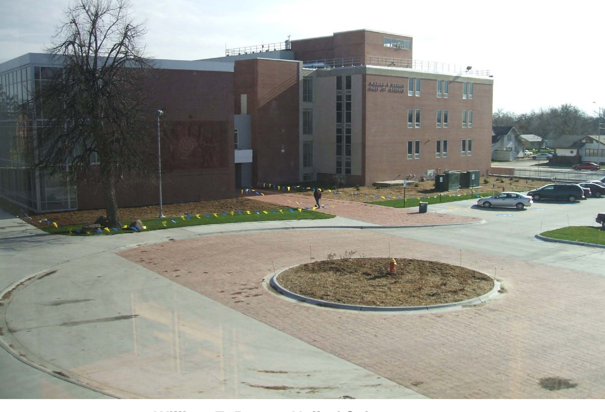
William E. Bruner Hall of Science, 2009 Looking Southeast from Calvin T. Ryan Library