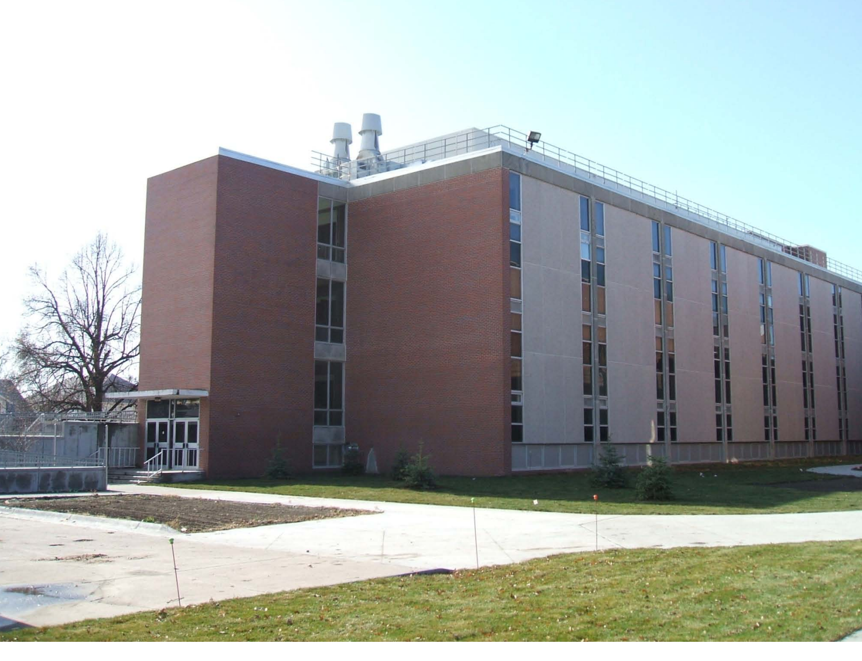
William E. Bruner Hall of Science, 2009 View Looks to the Southwest