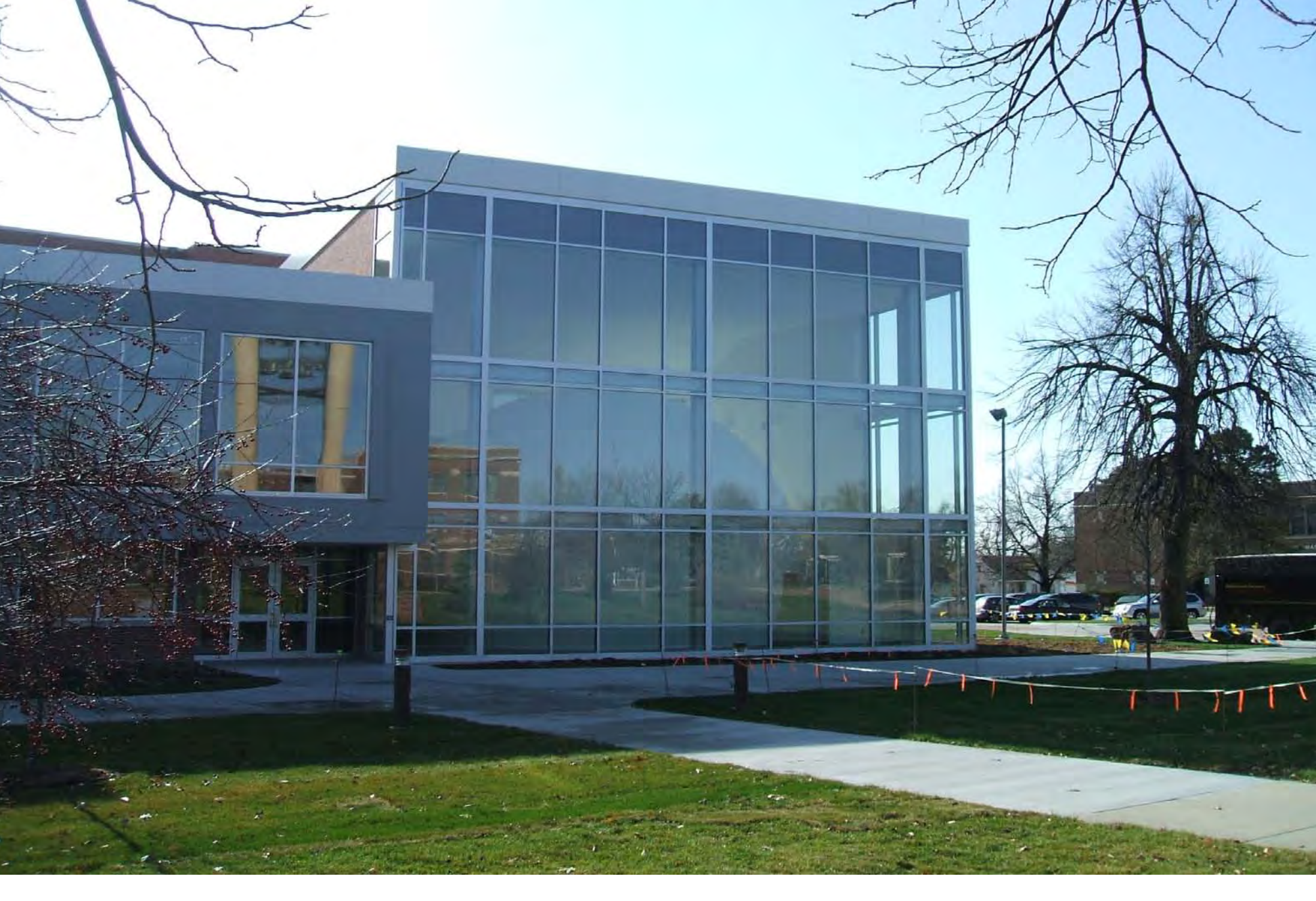
William E. Bruner Hall of Science, 2009 View Looks to the Southwest