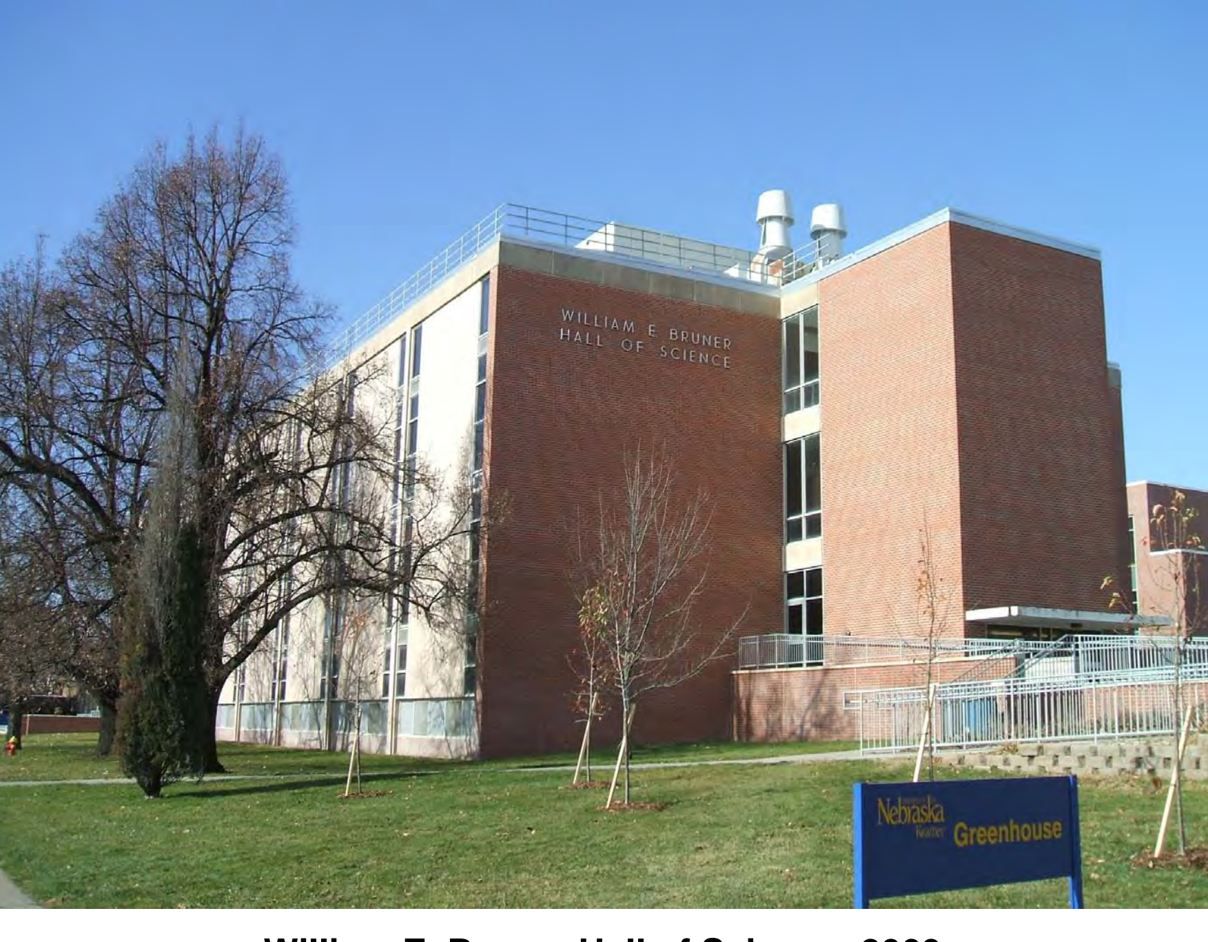
William E. Bruner Hall of Science, 2009 View Looks to the Northwest