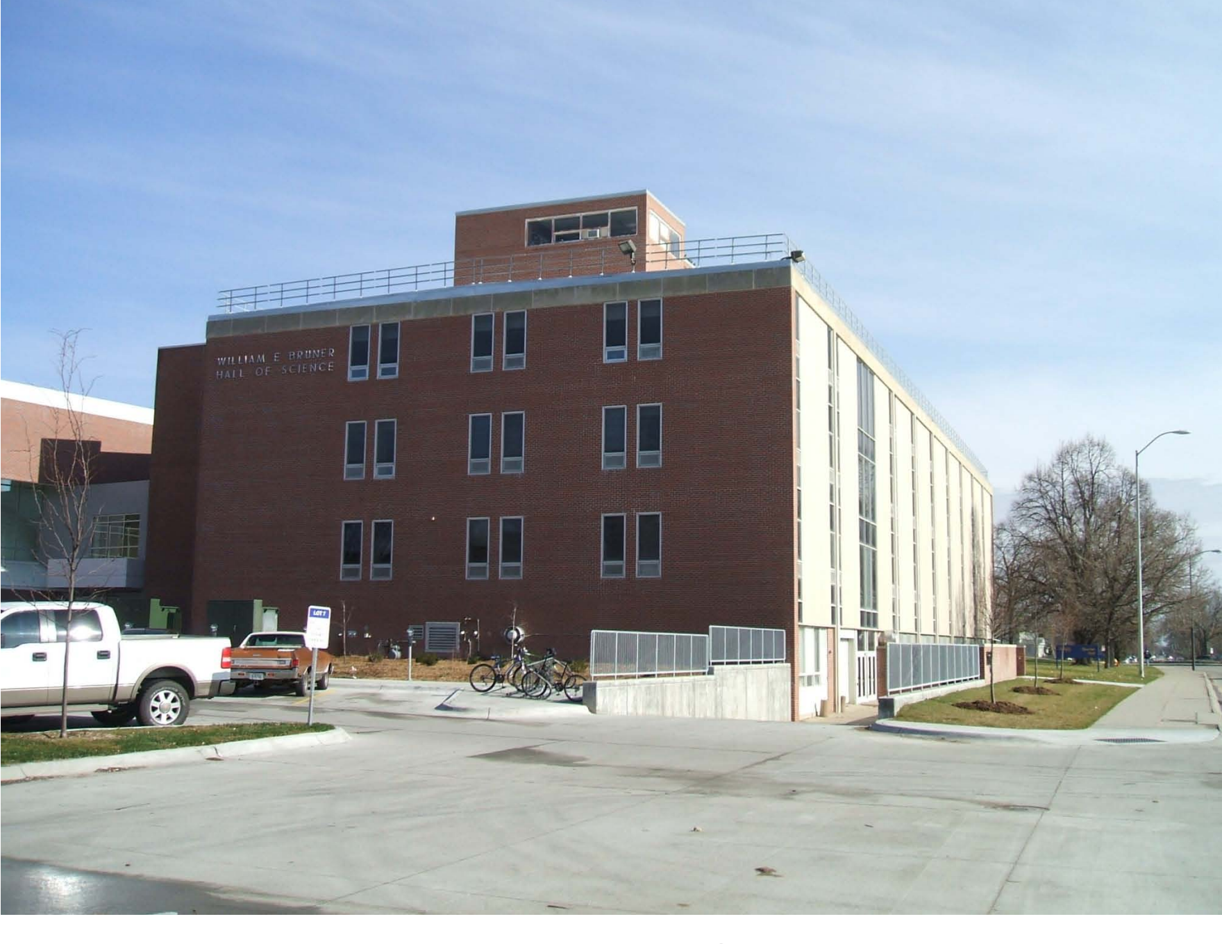
William E. Bruner Hall of Science, 2009 View Looks to the East-Northeast