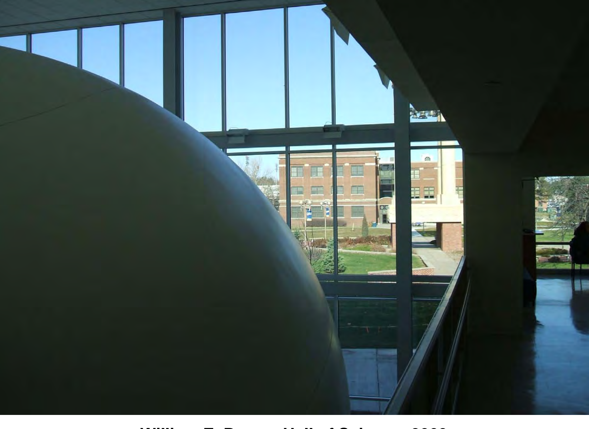
William E. Bruner Hall of Science, 2009 Looking Past Planetarium to Copeland Hall