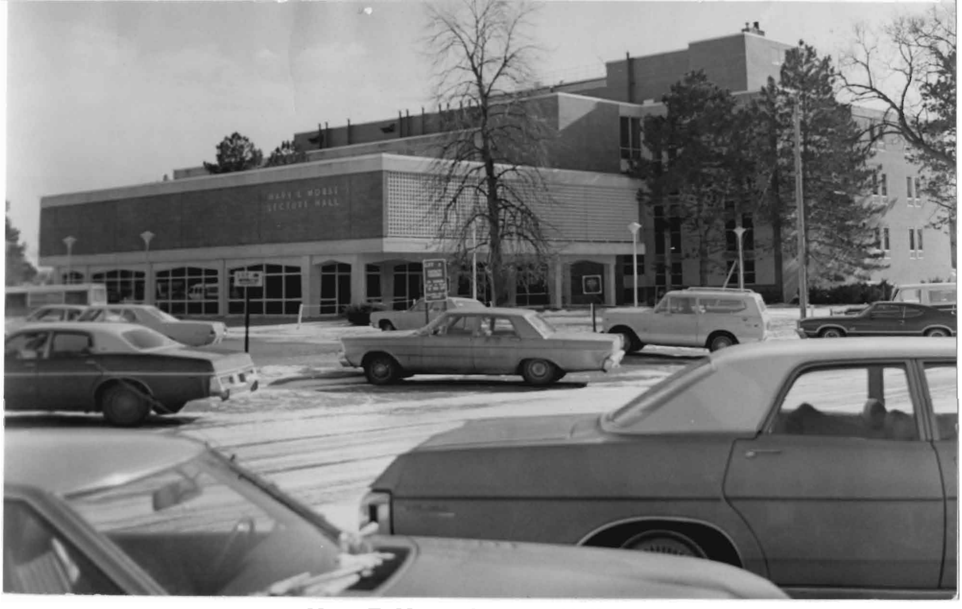
Mary E. Morse Lecture Hall, 1969 William E. Bruner Hall of Science Behind It View Looks to the Southeast