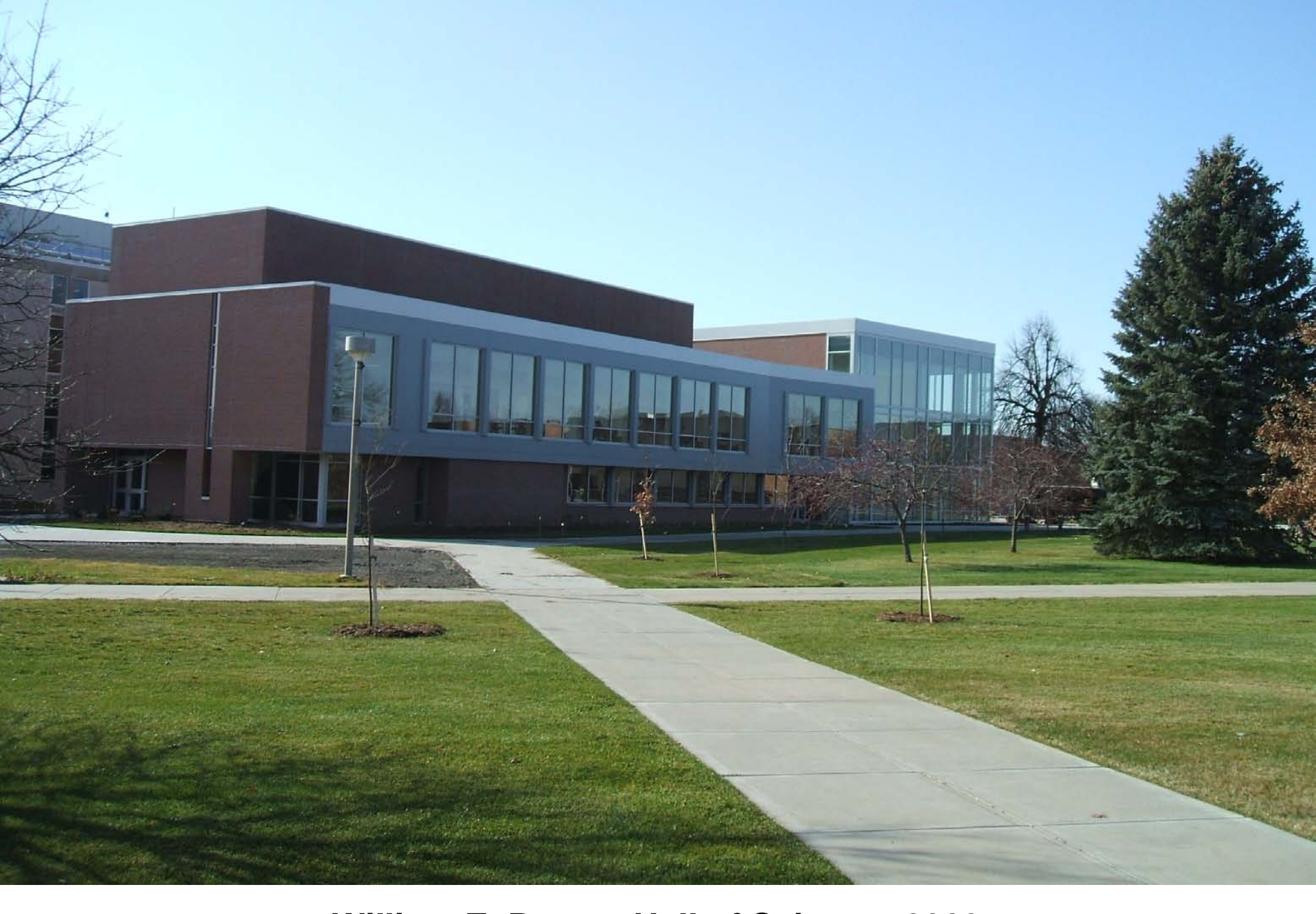
William E. Bruner Hall of Science, 2009 View Looks to the Southwest