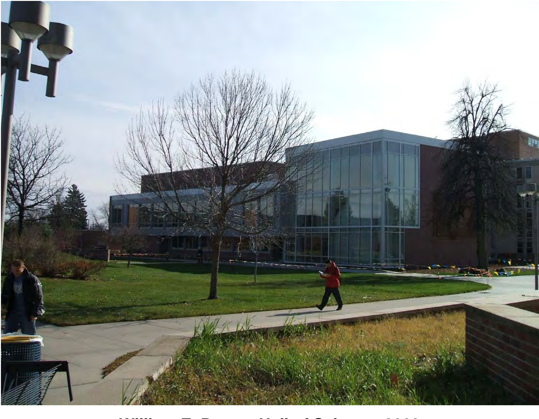
William E. Bruner Hall of Science, 2009 View Looks to the Southeast