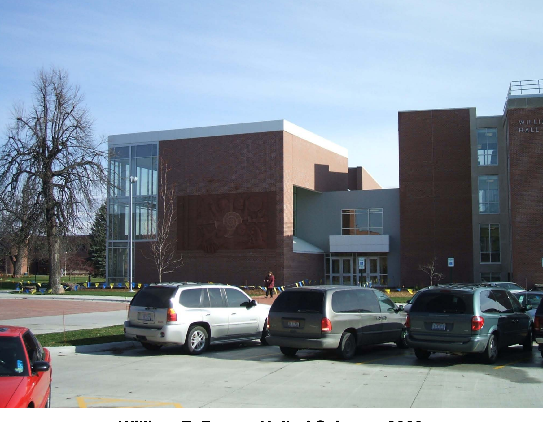
William E. Bruner Hall of Science, 2009 View Looks to the East-Northeast