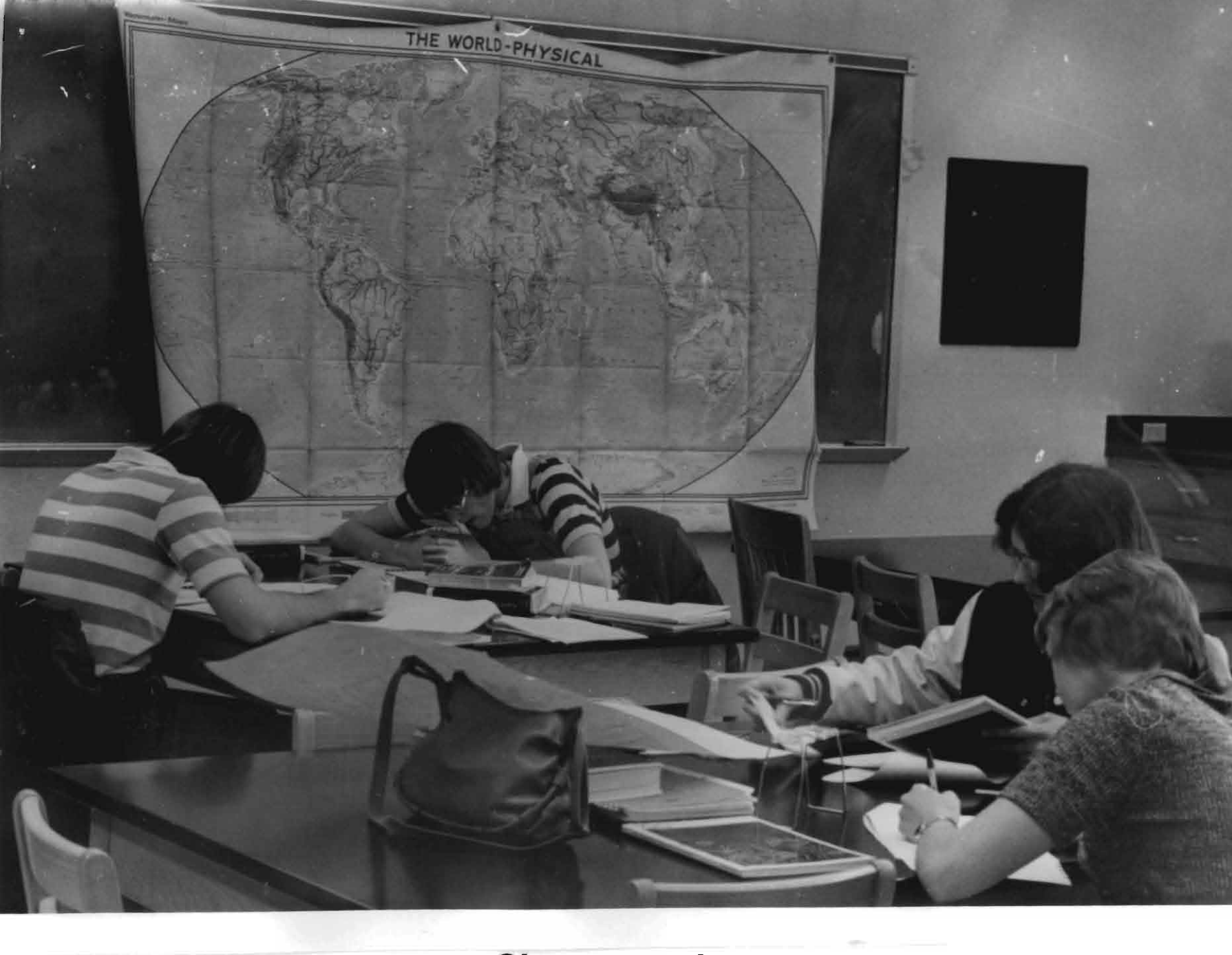
Classroom in William E. Bruner Hall of Science, 1977