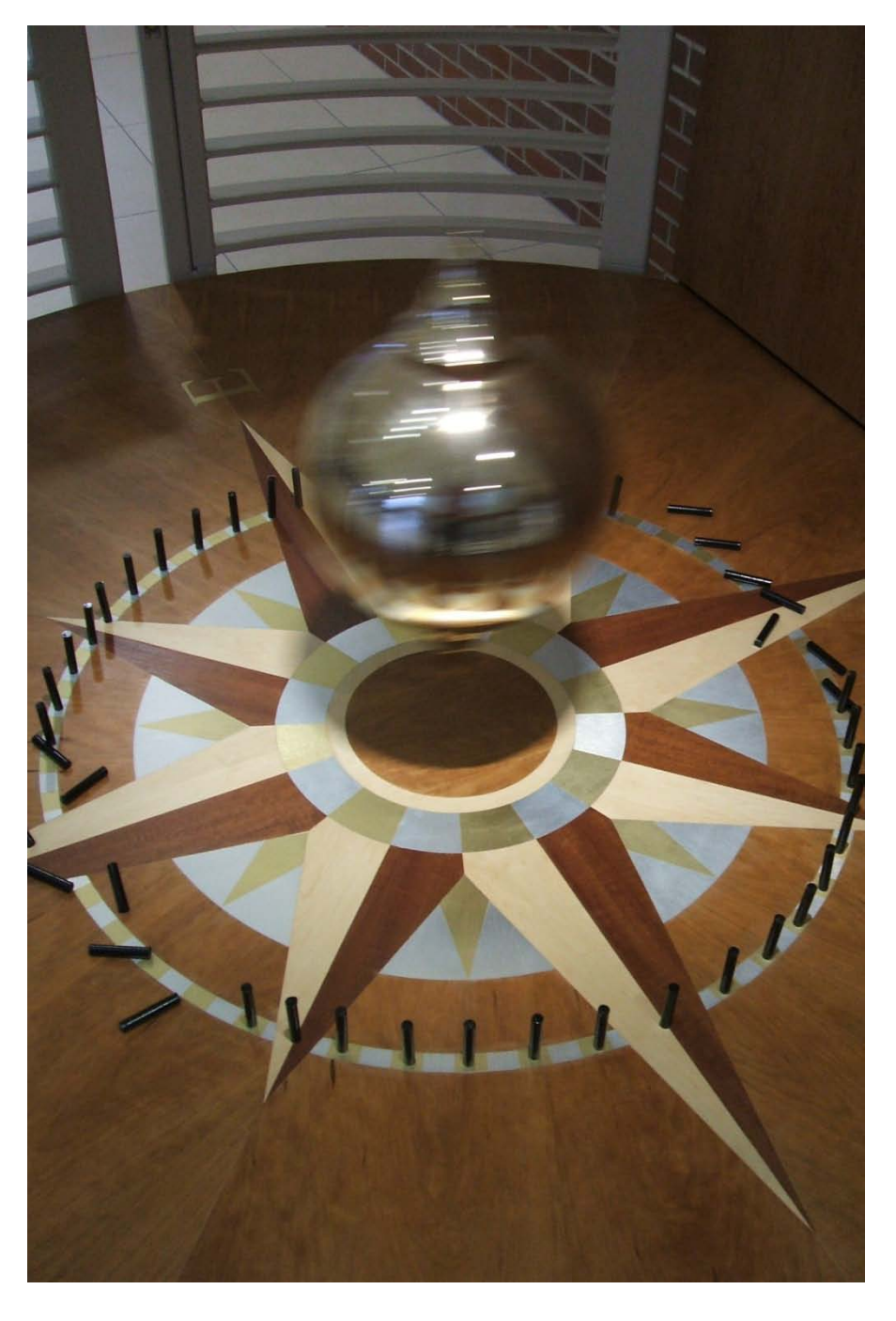
William E. Bruner Hall of Science Pendulum, 2009