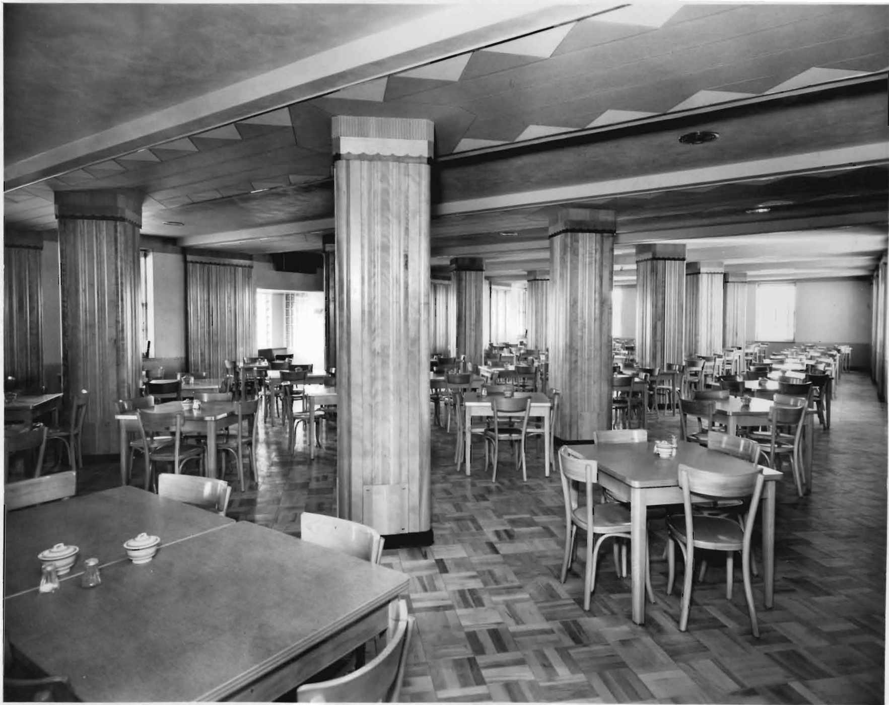
Men's Hall Main Dining Room, 1939-1958