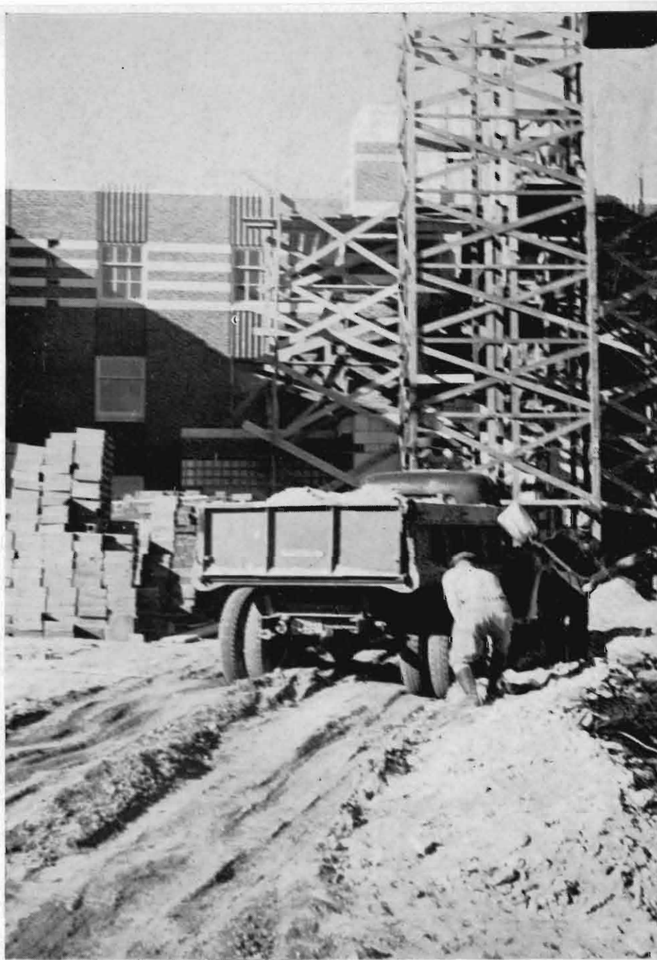
Men's Hall Under Construction, 1939