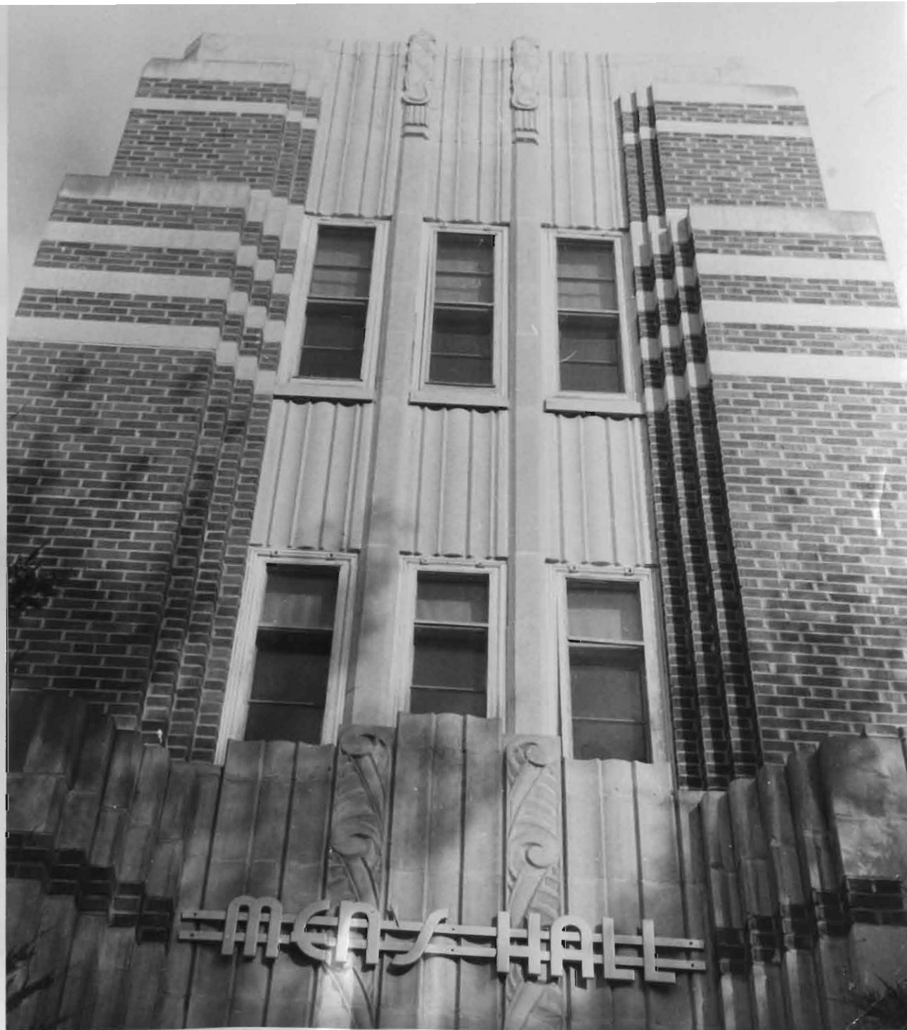
Men's Hall, Part of South Elevation, 1966