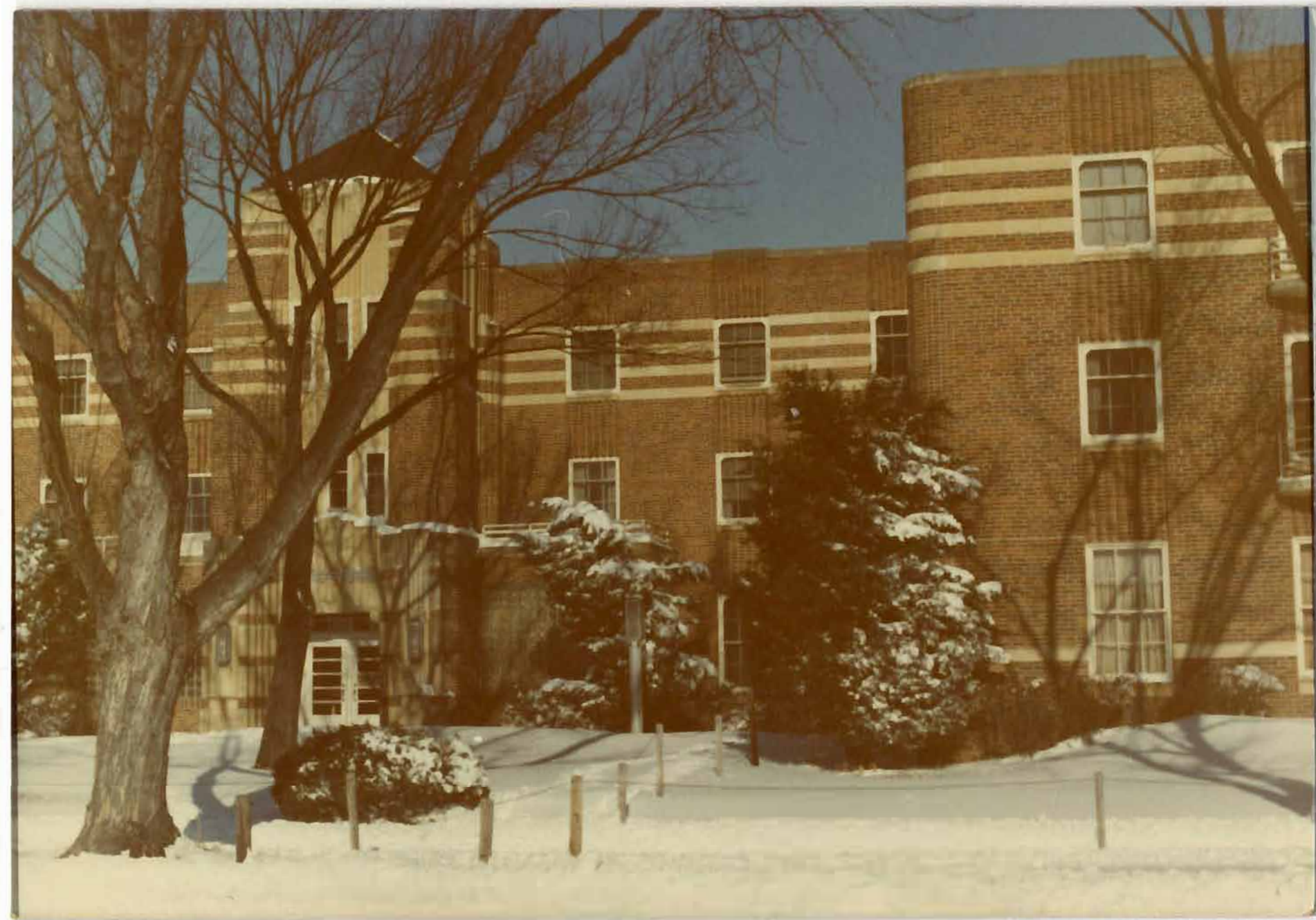
Men's Hall Winter Scene, 1980's