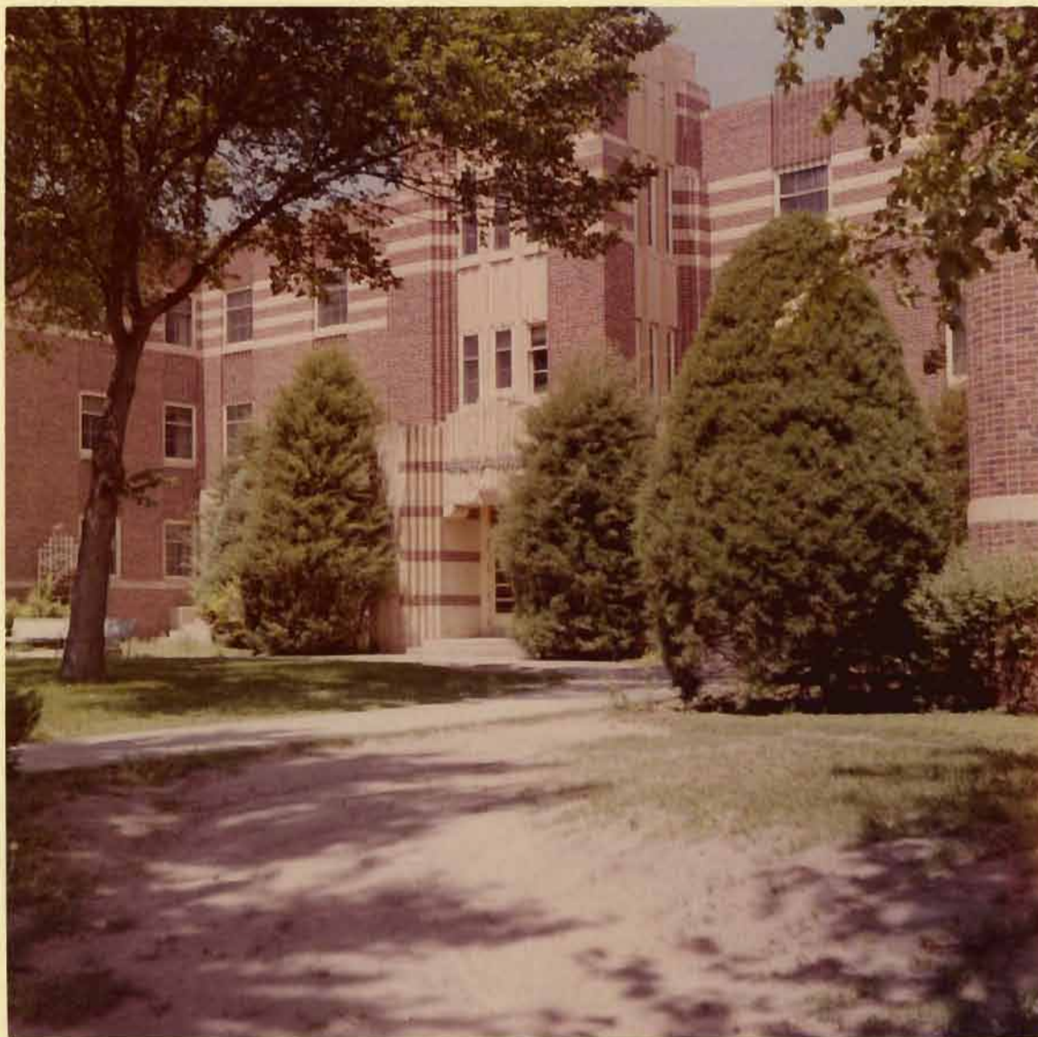
Part of South Elevation of Men's Hall