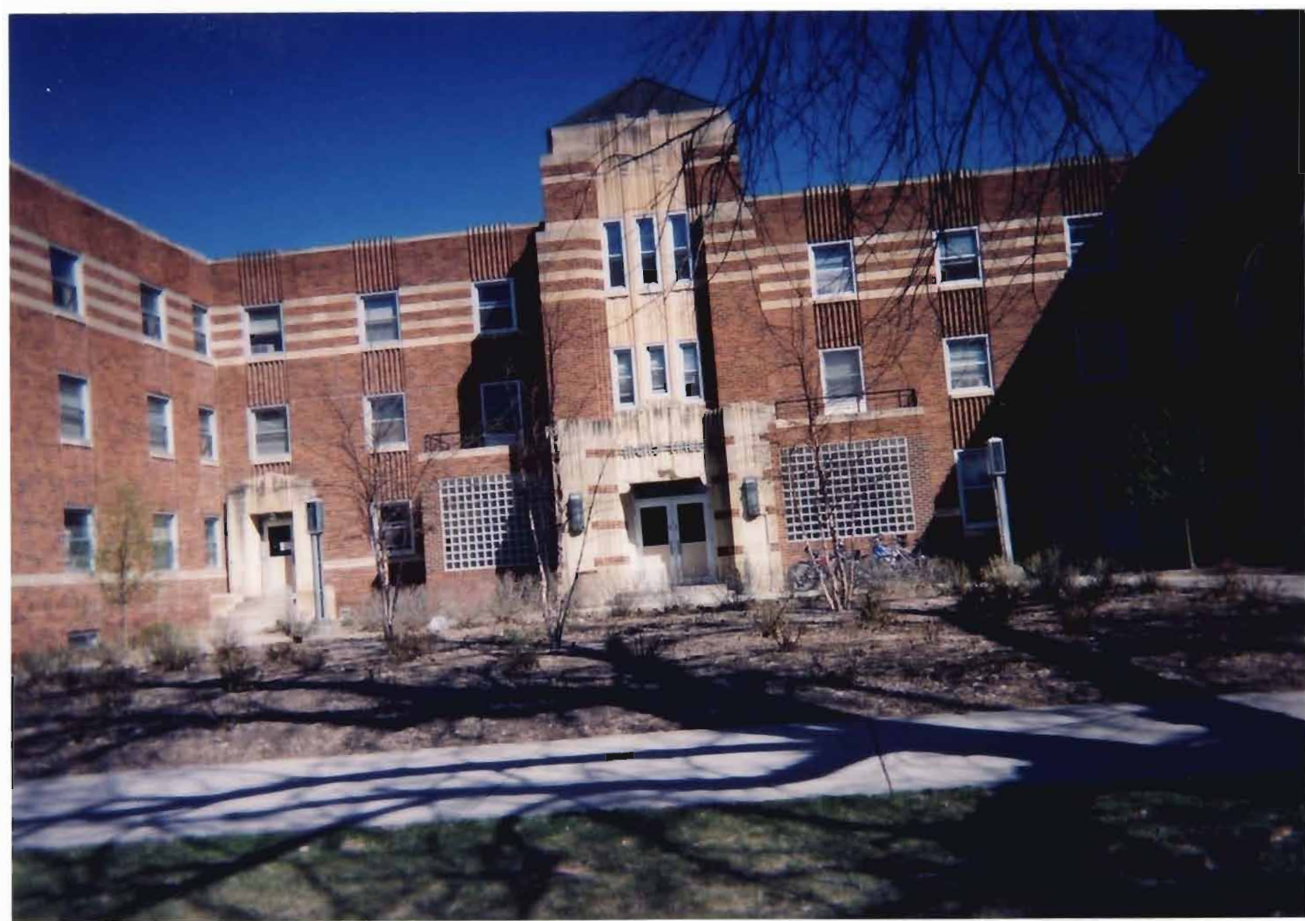
Part of South Elevation of Men's Hall, April 2005