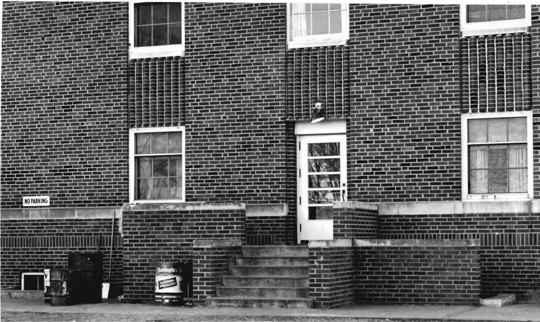
Back Door, Men's Hall, 1961