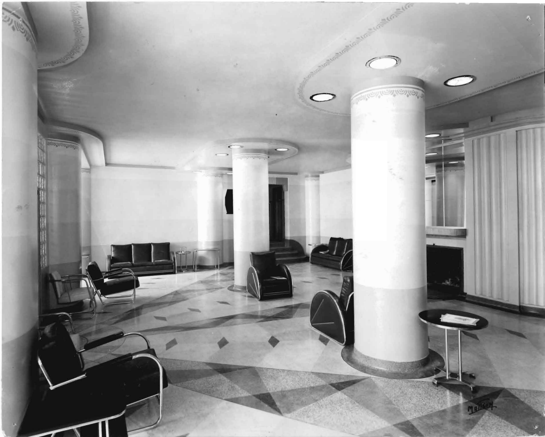
Men's Hall Lobby