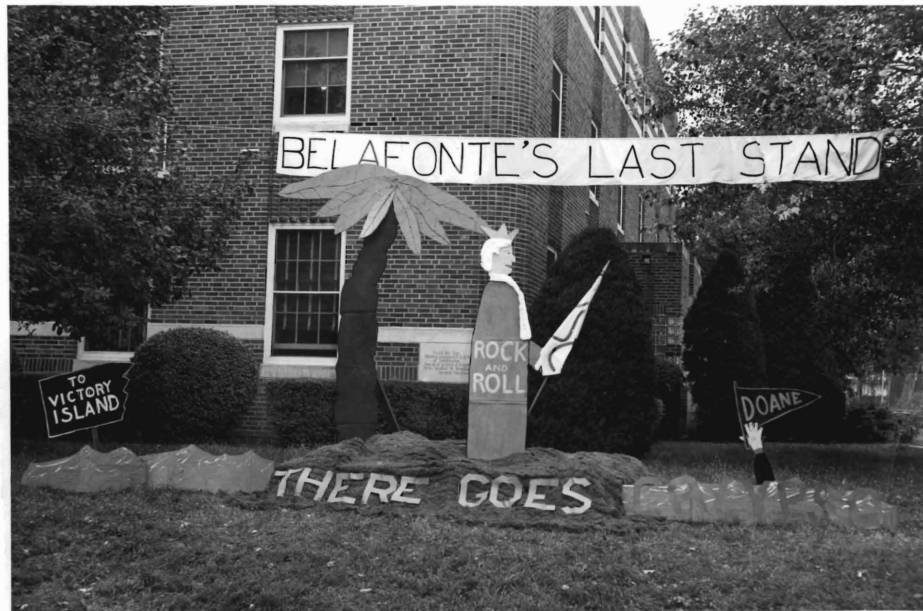
Men's Hall Display for Homecoming 1959