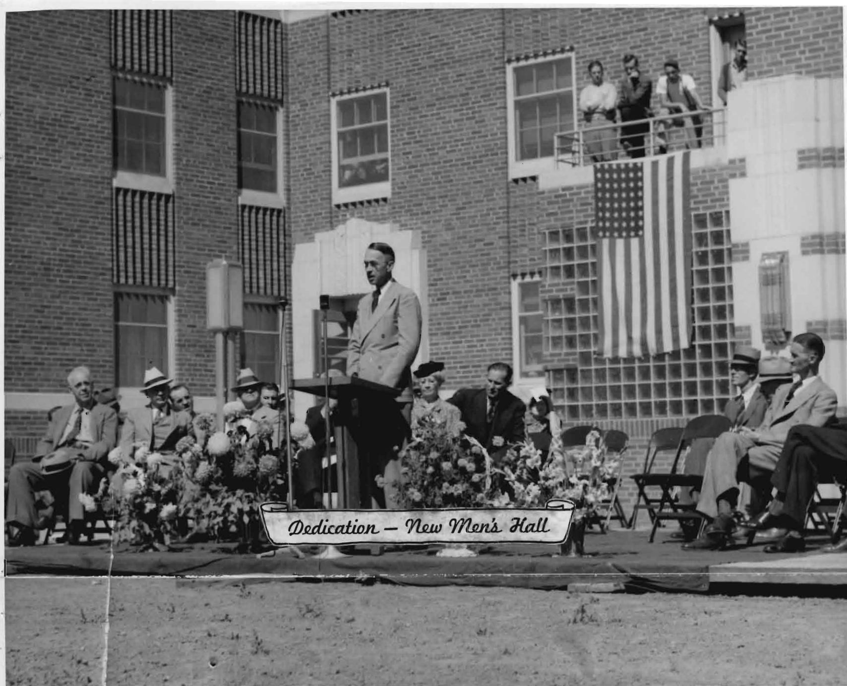
Dedication of Men's Hall, June 15, 1939