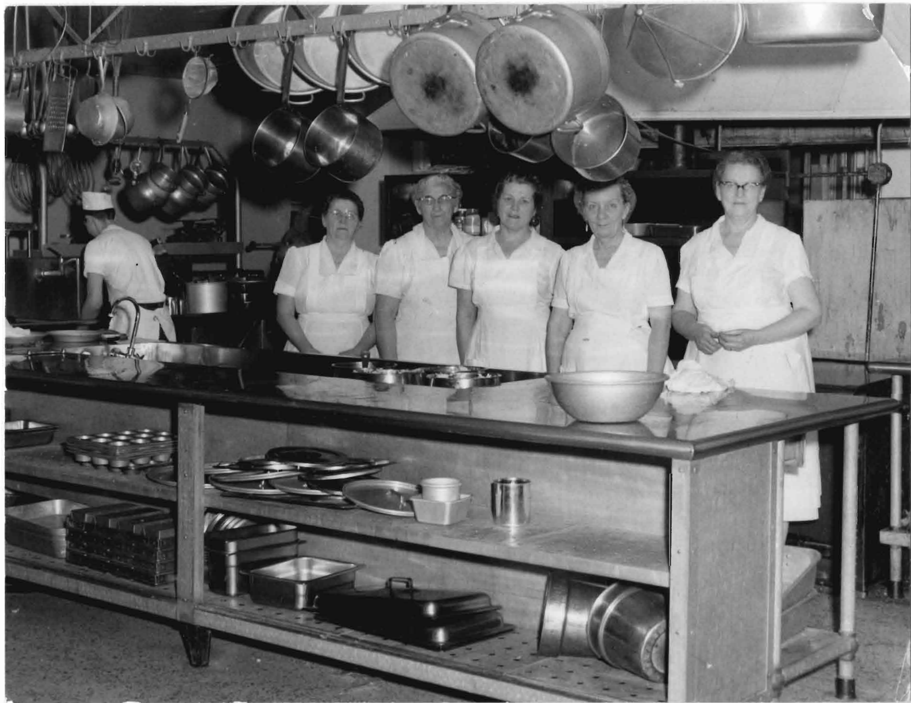
Cooks in the Kitchen in Men's Hall, 1950's