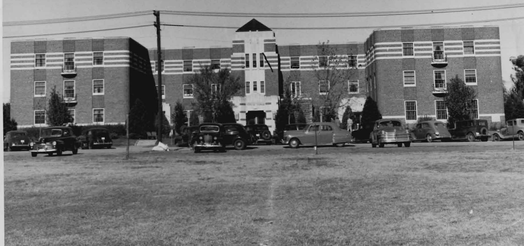
Men's Hall, South Elevation, 1950