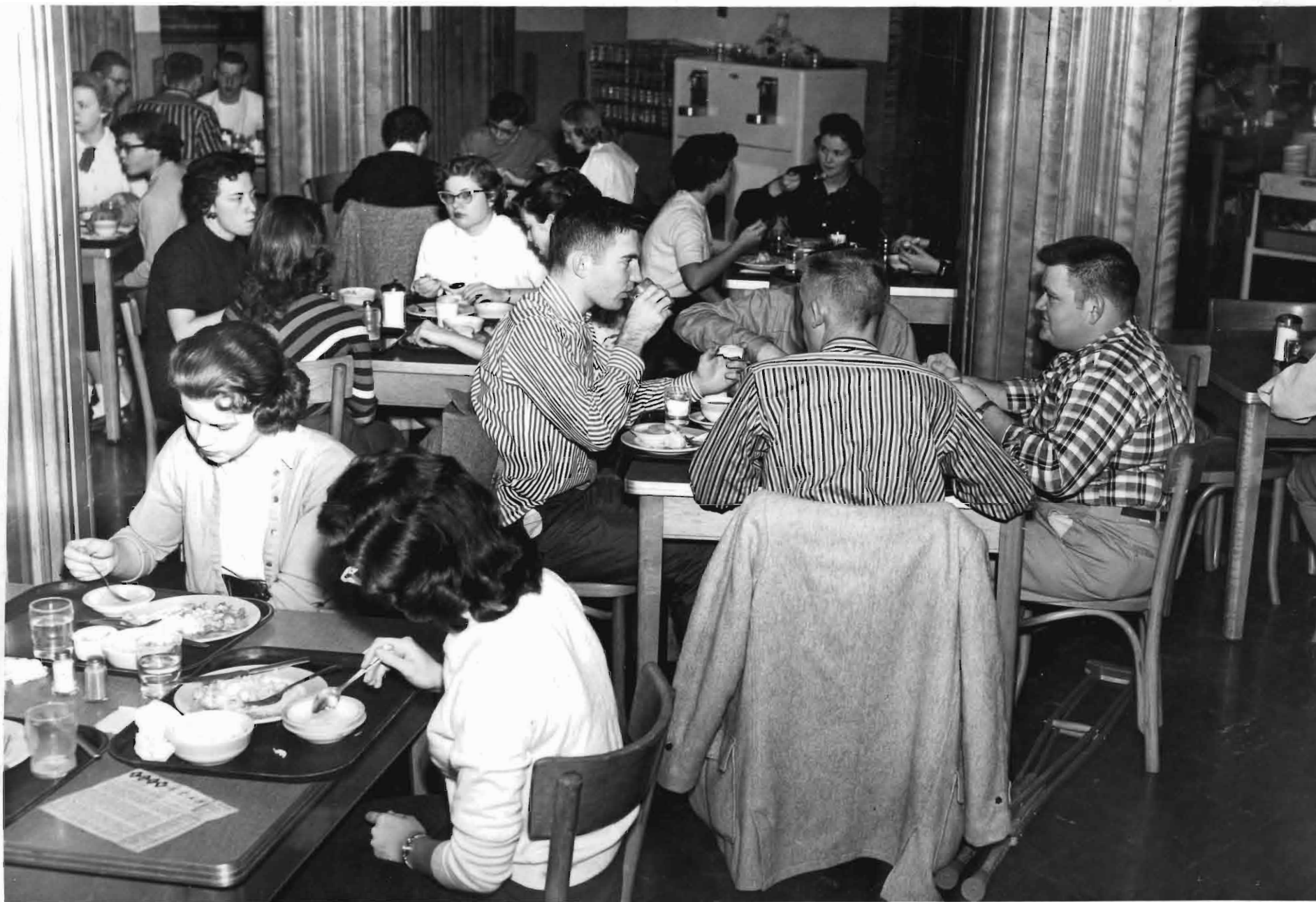
Men's Hall Cafeteria, 1957